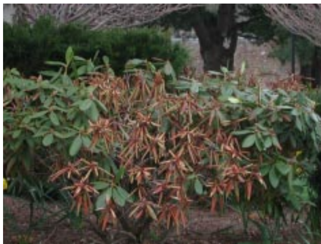
Winter injury on rhododendron

This newsletter is a cooperative effort of the Ornamentals Extension Educators and Specialists at the University of New Hampshire. It is published quarterly. Its purpose is to inform and update industry members on issues and research relevant to the production, use and maintenance of ornamentals and turf in New Hampshire.