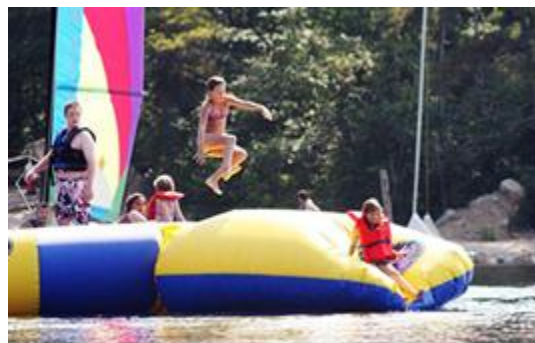
Ossipee Lake in New Hampshire.

The next will be a photography and videography focused program called “Capture Your Adventures!” from July 24 th -27 th . Military youth will learn how to express themselves through photos and videos, while gaining practical experience with the equipment and tools of the trade. Participants will be exposed to the techniques and practices involved in high quality photography and videography. At the same time, they will be working together and having fun at the beautiful Camp Calumet on