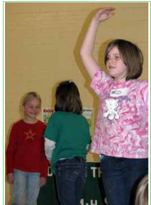
Pictured above are members of the Fun 4-H Club performing their skit during the 2011 International Foods Day stage presentations.

Members can set the tables and play fitness games while the leaders and parents warm the food to be served at noon. Bring enough of one dish to share!