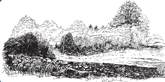
Drawing courtesy Linda Isaacson