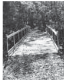
New bridge at Phillips Exeter