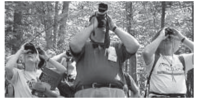
Birding at Woodland Hill Farm.

From that point on, all that occurred remains something of a blur. In our time together, we experienced the highest caliber lectures, interesting exercises, graciously hosted and vastly informative site visits, abundant food and great conversations. All were aimed at increasing our (and the public's) awareness of the resources available to those interested in taking a more active role in land use issues. We met top-notch state and county employees who redefined our image of public service as well as exceptionally well-spoken advocates of intentional land use and conservation concerns from past classes and supporting organizations. We also enjoyed good company and the entertainment of Helen Evans' Privy Show.