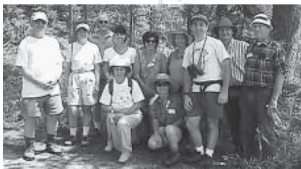
Intrepid Coverts hikers in the Ossipee Pine Barrens Preserve.