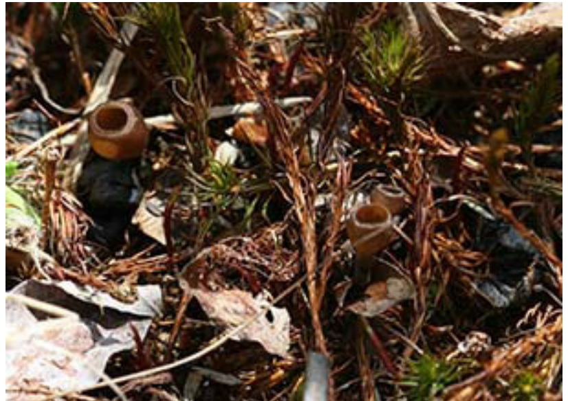
Opening mummy berry fungus "mushrooms"

Ascospore release occurs during cool wet weather , and the spores that land on tender blueberry leaves cause primary lesions. These cause the affected leaves to turn grayish-brown, shrivel, and release thousands of secondary spores (conidia). These are the spores that infect the fruit. They are spread by splashing. Infected fruit show no symptoms at first. When the fruit approach maturity and should begin ripening, the infected ones become noticeable. They turn a gray-salmon color, start to shrivel, and drop to the ground. They eventually turn black and become ridged, like a tiny black pumpkin. There they sit, and wait for next year to start the cycle again. Rainy springs are ideal for spread and development of mummy berry. The disease can be severe in rainy years, and relatively light in dry years (especially dry springs).