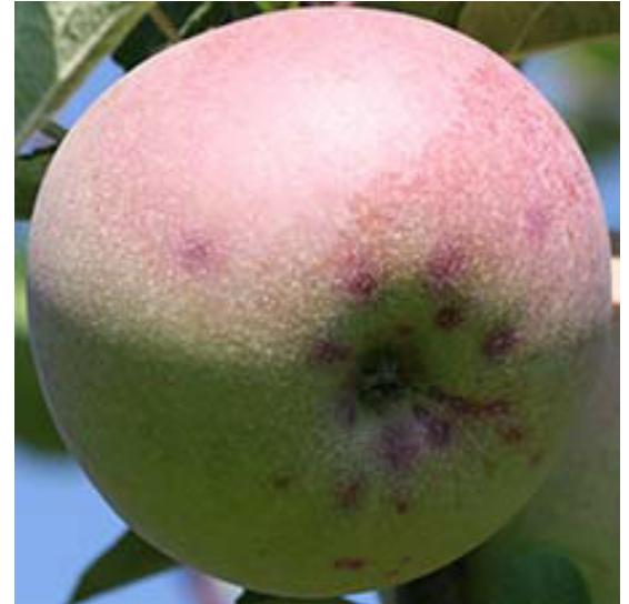
(San Jose Scale damage)

The other vulnerable time is at about half inch green stage, when the young scales can be smothered by oil. If your primary target is European red mite, then using oil slightly later is more effective, but if SJS is the primary target, then half inch green is the time. As usual, you need the weather to cooperate, too. Ideally, we would want the temperatures to stay above the 30's for 24 hours after applying oil. When applying oil, VERY GOOD coverage is required. If you can't get thorough coverage, don't bother applying it. That means dilute application rate, high gallonage, low sprayer speed.