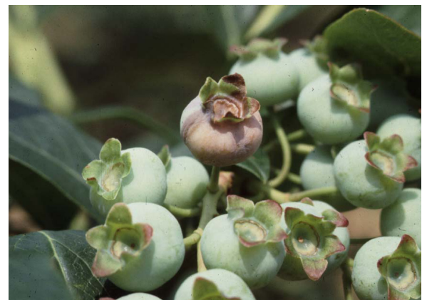
Fruit infected with mummy berry fungus

Ascospore release occurs during cool wet weather , and the spores that land on tender blueberry leaves cause primary lesions. These cause the affected leaves to turn grayish-brown, shrivel, and release thousands of secondary spores (conidia). These are the spores that infect the fruit. They are spread by splashing. Infected fruit show no symptoms at first. When the fruit approach maturity and should begin ripening, the infected ones become noticeable. They turn a gray-salmon color, start to shrivel, and drop to the ground. They eventually turn black and become ridged, like a tiny black pumpkin. There they sit, and wait for next year to start the cycle again. Rainy springs are ideal for spread and development of mummy berry. The disease can be severe in rainy years, and relatively light in dry years (especially dry springs).