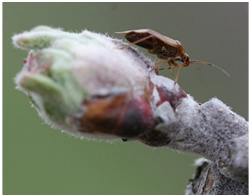
Tarnished Plant Bug on advanced green tip apple bud

mature by the 25th in Durham. Many of those were probably released in Saturday's daytime rains.