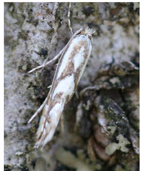
Leafminer adult on apple bark

Apple leafminer traps are dark red sticky rectangles, about 8 x 13 inches. Attach them to the south side of the trunk, at knee height. I use push pins in each corner, but some people prefer staples. The time to set them out is at ¼ inch green stage. Then check them weekly for the tiny black