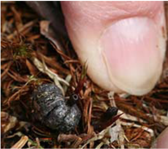
Mummy berry fungus stalk emerging

Mummy berry is a blueberry disease caused by the fungus Monilinia vaccinii-corymbosi . The fungus overwinters in last year's mummified blueberries lying on the ground. About the time that blueberry buds are swollen and starting to open, the fungal stipes begin to grow out of the mummies. They are dark brown, and the tips swell and open into light brown "mushrooms". When the tips of the stipes (stalks) begin to open (they look a bit like a finish nail then) they are ready to release ascospores to spread the infection.