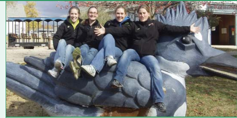
All smiles in Kentucky!