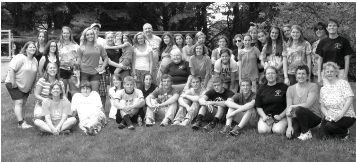
Pictured at right are members, leaders and parents of the Sullivan County 4-H Teen Club with their guests from Winona County Minnesota 4-H.

As with past 4-H Teen Exchange trips, our 4-H teens and their leaders will travel to visit Minnesota next summer and stay with host families and explore Winona County.