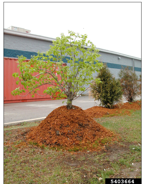
Improper way to apply mulch, referred to as a "Mulch Volcano".