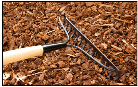
Wood chips can be used as mulch.

All natural mulches should be applied after the crop has begun to grow and after the soil has warmed; do not allow mulch materials to contact plant stems, as this increases the risk of disease. The soil should also be weed-free and moist.