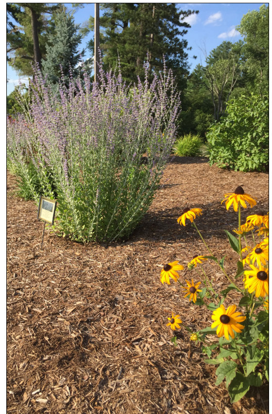
Mulch is applied to increase plant growth.