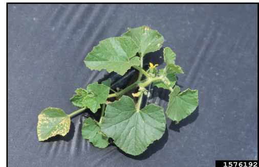
Black plastic used as mulch.