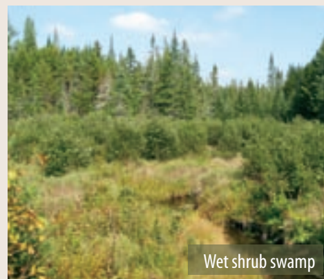
Wet shrub swamp

Shrublands exist in patches throughout the state, but most are difficult to recognize on traditional satellite imagery, so their total expanse in the state is unknown. Communities that map the location of shrublands as part of a natural resource inventory are encouraged to send their data to New Hampshire Fish & Game to contribute to statewide habitat data.