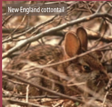
New England cottontail

An endangered species in New Hampshire, New England cottontail rabbits prefer dense thickets such as overgrown fields and forests less than fifteen years old. These rabbits only occur in New Hampshire in the lower Merrimack River Valley and in the Seacoast. They feed on grasses and leaves of wildflowers in the summer, and bark and twigs of shrubs and trees in the winter. Populations of these rabbits have suffered from habitat loss and the introduction of eastern cottontail rabbits, which were first released in the early 1900s. Eastern cottontails are now common, being better adapted to developed landscapes. For more information about New England cottontail conservation, consult the publication "New England Cottontail Rabbits in New Hampshire," available from UNH Cooperative Extension.