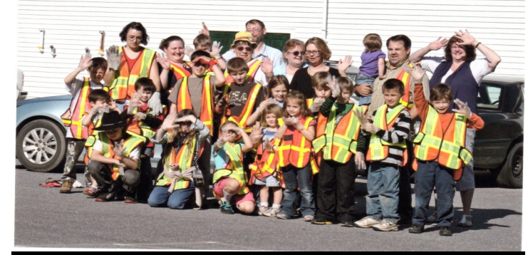
Members and Leaders of the Chapel Valley 4-H Club all pitched in to clean up their community!

Meeting new people, seeing new places, learning new things, and becoming friends with those who may have different backgrounds, are all part of out -of-county, often over night, experiences.