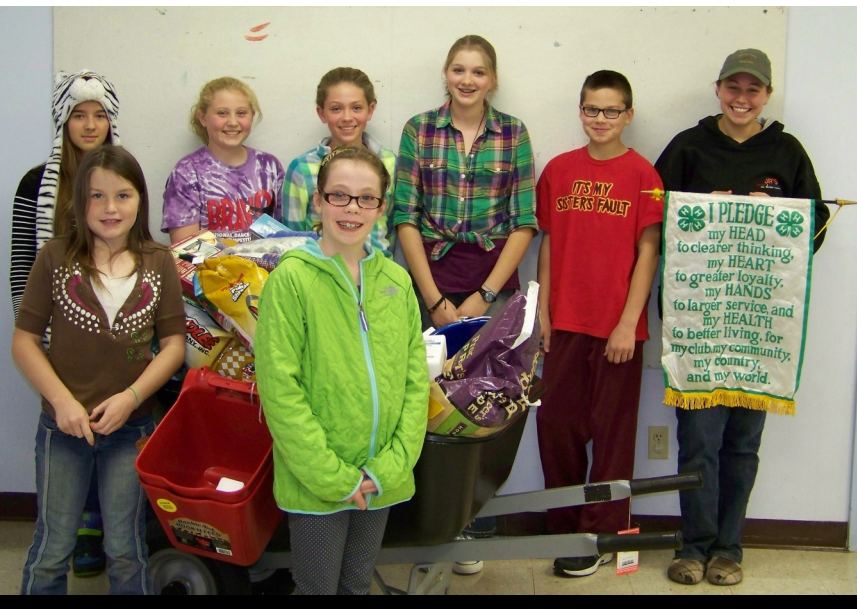
The Winnisquam Whinnies hand crafted dog and cat toys which then sold to raise funds for the Live and Let Live Farm. They used the over $350 to purchase much needed supplies for the horse rescue league