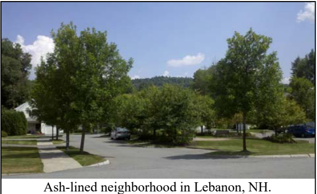
Ash-lined neighborhood in Lebanon, NH