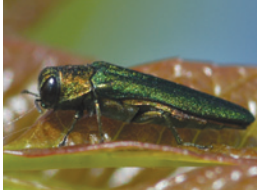
EAB adults must feed on foliage before they become reproductively mature.

This restricts the number of trees that can be treated in an area.