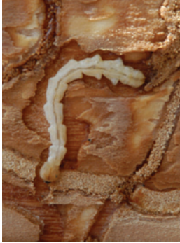
EAB larvae damage the vascular system of the tree as they feed, which interferes with movement of systemic insecticides in the tree.

Application protocols and conditions of the trials have varied considerably, making it difficult to reach firm conclusions about sources of variation in efficacy. This inconsistency may reflect the fact that application rates for soil-applied systemic insecticides are based on amount of product per inch of trunk diameter or circumference. As the trunk diameter of a tree increases, the amount of vascular tissue, leaf area and biomass that must be protected by the insecticide increases exponentially. Consequently, for a particular application rate, the amount of insecticide applied as a function of tree size is proportionally decreased as trunk diameter increases. Hence, application rates based on diameter at breast height (DBH) may effectively protect relatively small trees but can be too low to effectively protect large trees. Some systemic insecticide products address this issue by increasing the application rate for large trees.