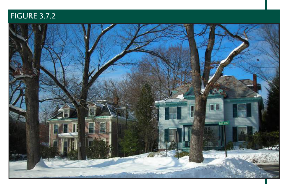
Unique neighborhood in Concord, NH.

With those mandates, and the availability of grant funding, the Planning Board decided to develop a Neighborhood Heritage District ordinance for the village center. A volunteer advisory committee assisted the Planning Board chair in extensive outreach efforts. A preservation consultant surveyed the area's historic resources and proposed boundaries and review criteria. The regional planning commission assisted in drafting the ordinance for a new Neighborhood Heritage District overlay. Public forums were