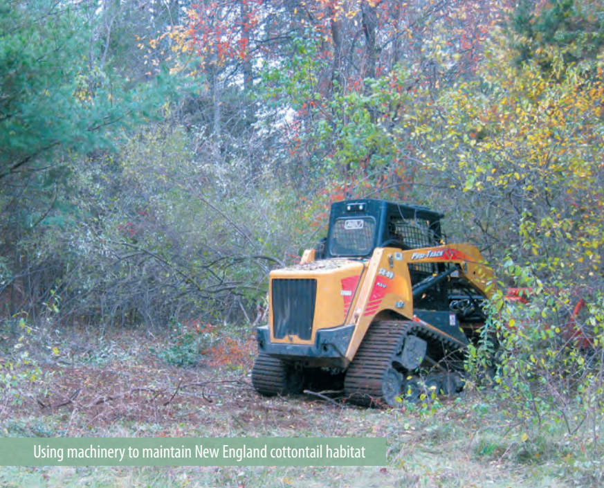
Using machinery to maintain New England cottontail habitat