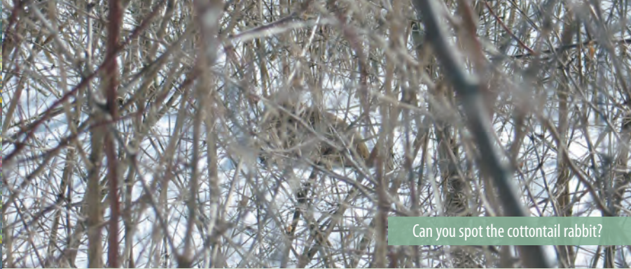
Can you spot the cottontail rabbit?