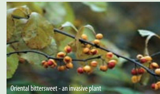
Oriental bittersweet - an invasive plant