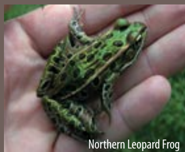
Northern Leopard Frog

The northern leopard frog is strongly associated with grassy floodplain areas along major rivers in the state, including the Merrimack, Connecticut and Androscoggin rivers. These amphibians require slow-moving water for breeding and dense, low vegetation as cover and feeding habitat. Landowners can help this species by protecting the open, grassy areas associated with agricultural lands along floodplains. Many areas have been developed or have reverted to forested habitats, resulting in declining numbers of northern leopard frogs.