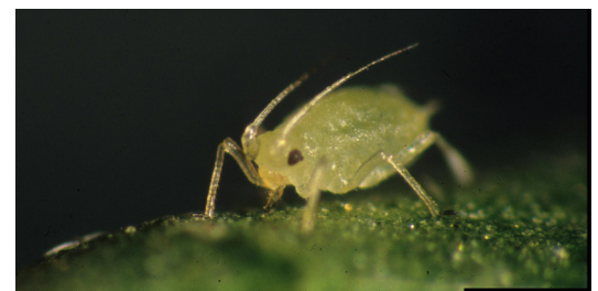
Immature greenhouse aphids.

Wingless females called "stem-mothers" have the ability to give birth to living young without mating.