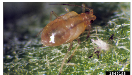
Adult green peach aphids.

Most aphids overwinter as eggs on perennial plants or in plant debris, but some also overwinter as adult females. In spring, nymphs emerge from the eggs and quickly develop into adults. These adults are wingless females called "stem-mothers" and have the ability to give birth to living young without mating. Within a two-week period, one