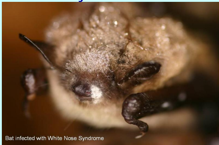
Bat infected with White Nose Syndrome