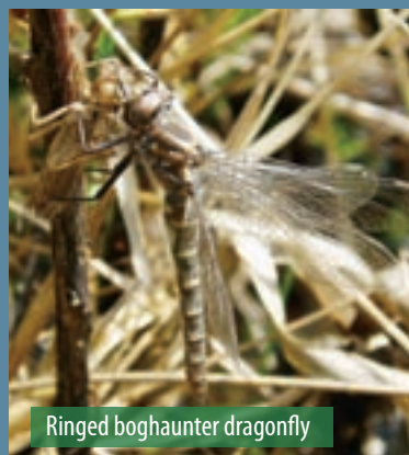
Ringed boghaunter dragonfly

This state-endangered dragonfly breeds in peatlands with Sphagnum moss and open pools of water. The larvae stay in the water for up to three years before emerging as inconspicuous black- and brown-banded adults. They are among the earliest dragonflies to emerge in spring, usually during the first two weeks of May. Adults spend much of their time foraging on flying insects in nearby woodlands. This dragonfly has been identified in only a few peatland habitats, all of which are located in southeastern New Hampshire, near housing developments. Protecting the remaining woodlands near these peatlands is critical to the survival of this dragonfly.