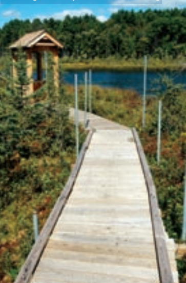
Floating walkway over Mud Pond Bog