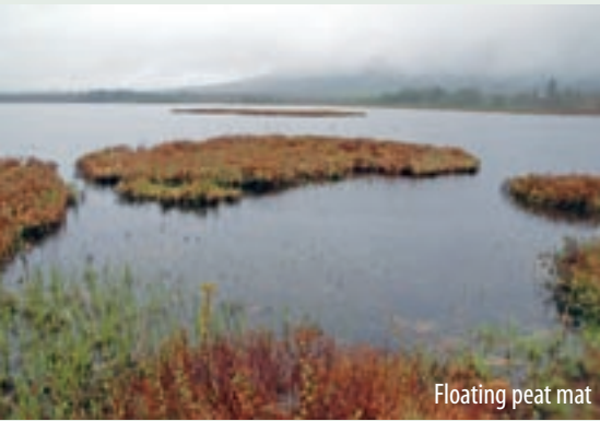
Floating peat mat

Peatlands are wetland ecosystems that contain peat, a spongy, organic material formed by partially decayed wetland plants. Typically found in cool climates, peatlands are associated with acidic or stagnant water that is low in oxygen.