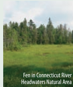
Fen in Connecticut River Headwaters Natural Area