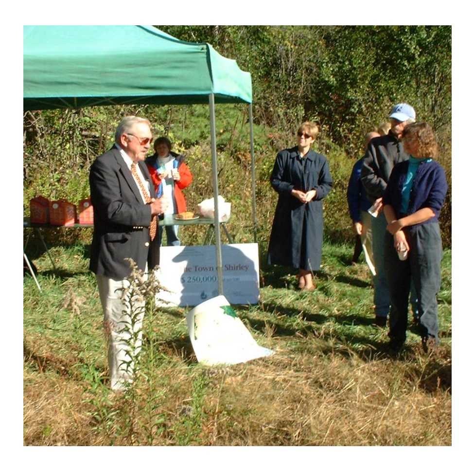
Cost Share and Conservation Payments