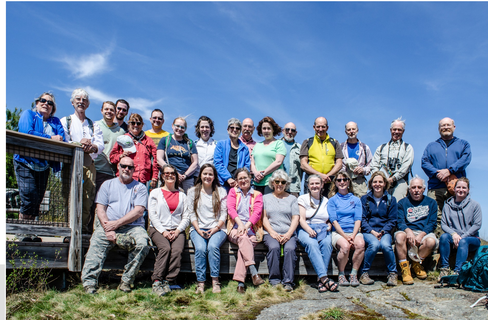
Volunteers Working for Wildlife