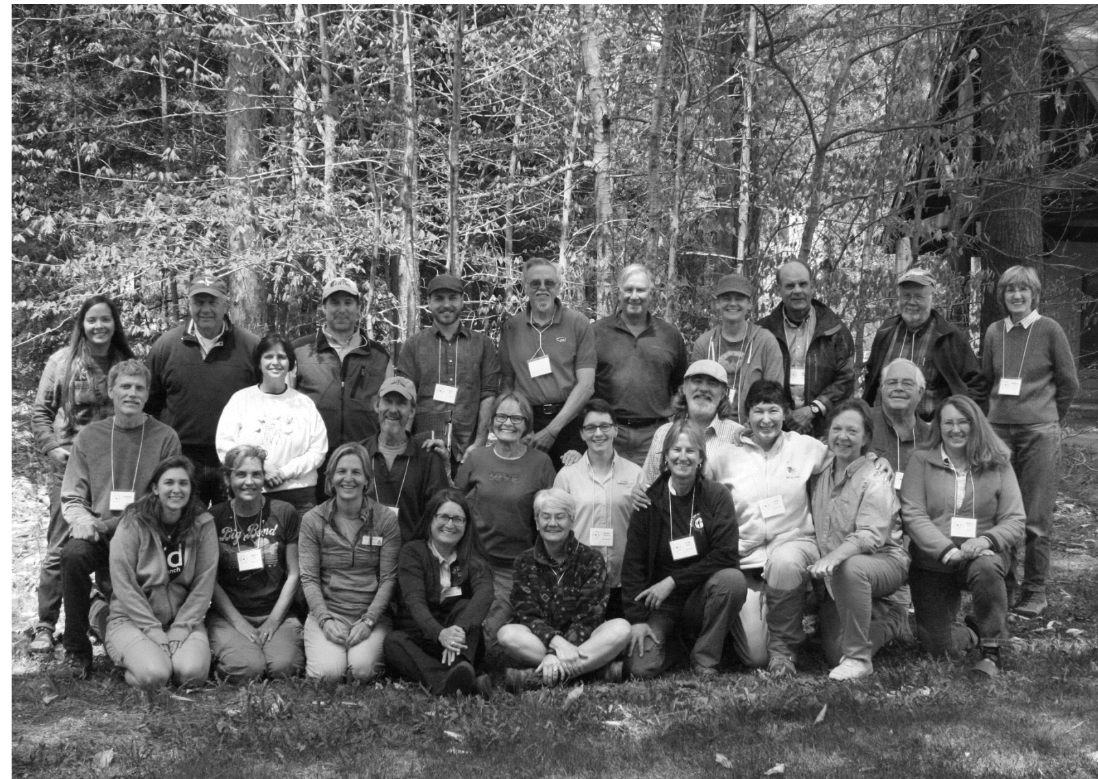
Volunteers Working for Wildlife