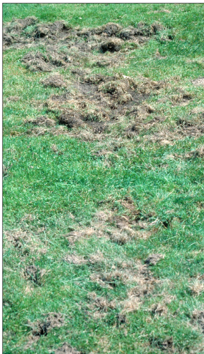
Grass turf damaged by Japanese beetle larva.