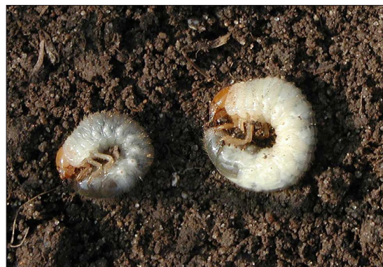
White grubs - Japanese beetle (left) and European chafer (right).

White grubs are the larval or grub stage of several species of beetles and chafers. The two most troublesome species in New Hampshire are the European chafer and the Japanese beetle.