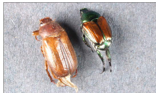
White grubs : adult European chafer (left) and Japanese beetle (right).

White grubs are the larval or grub stage of several species of beetles and chafers. The two most troublesome species in New Hampshire are the European chafer and the Japanese beetle.