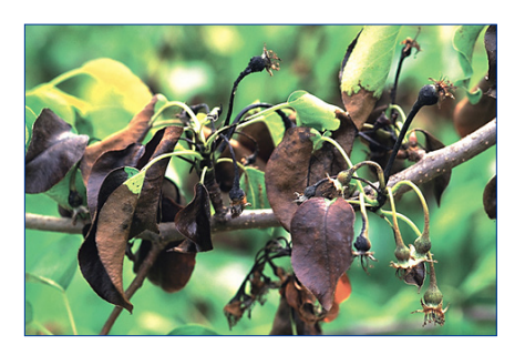
Fire blight on pear.