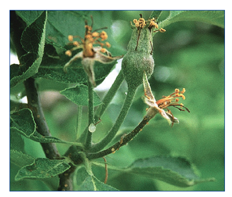
Fire blight infections on apple blossoms; note the discolored blossom on the lower right and droplets of bacterial ooze.

Red , Rome , and many crabapple varieties. Pears: Most pear varieties are susceptible: Bartlett , Aurora , Bosc , Anjou , Clapp's Favorite , and several Asian cultivars. Seckel is somewhat resistant.)