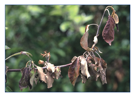
Fire blight on apple shoot; note Shepard's crook at shoot tip.