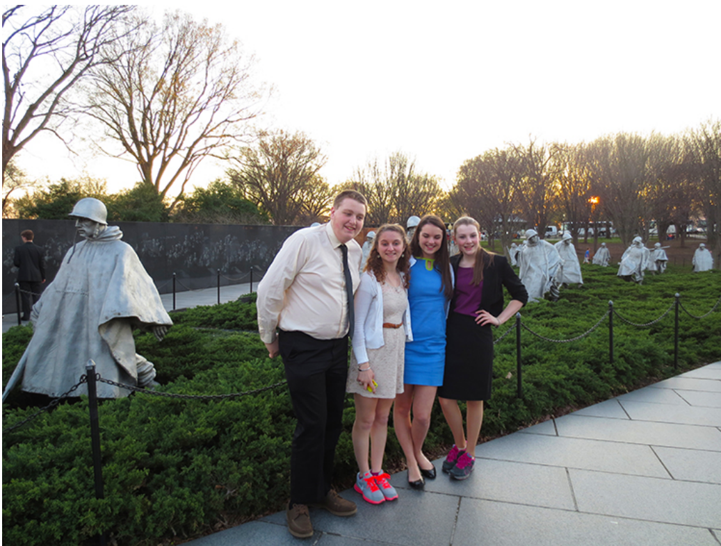
Korean War Memorial