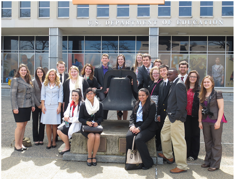
Department of Education