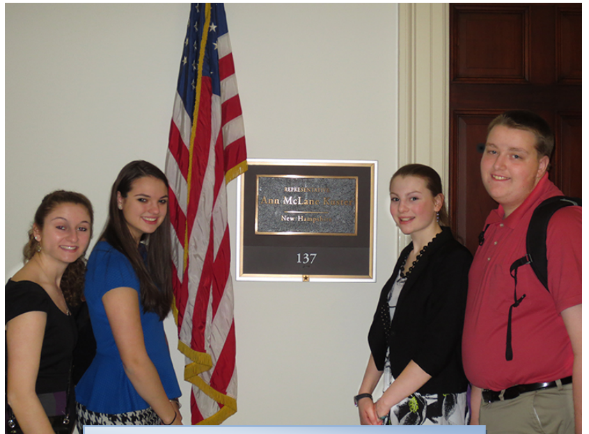
U.S. Congresswoman Annie Kuster's office