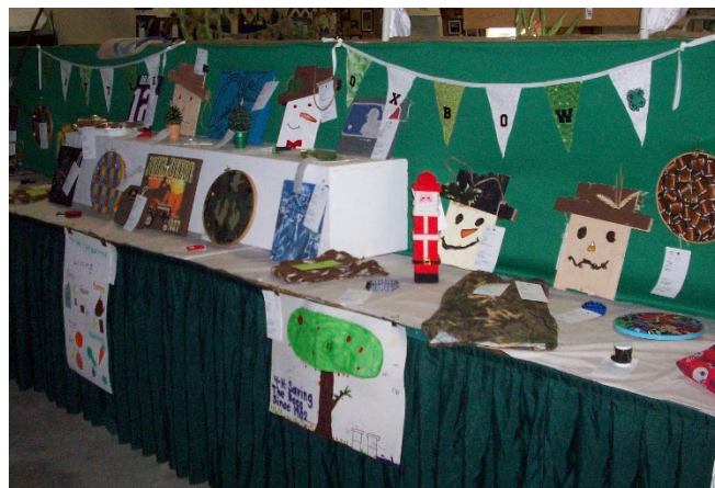
2017 North Haverhill Fair The Exhibit Hall theme was "Summertime Markets" (left to right) Lyme Little Tigers 4-H Club & Little Oxbow 4-H Club Displays