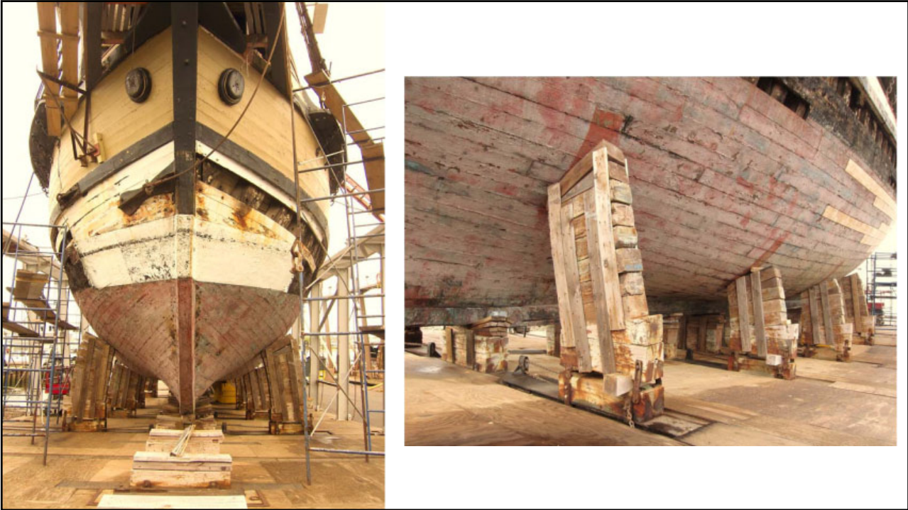
Port Side, March 2013