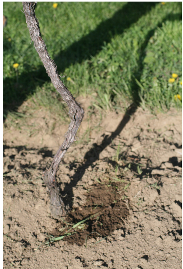
Figure 6 - Lacrima (bleeding) of a grape vine after pruning in April can be quite dramatic, but does no harm.