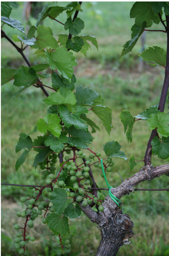
Figure 5 - The 2 gemme (buds) on the cornetto (renewal spur) each become a tralcio (fruiting shoot) bearing grappoli (bunches of grapes). One will become the braccio (lateral branch tied to the wire) next year, the other the cornetto (2 bud renewal spur).

Pruning is done in late winter/ early spring. When pruning in late spring, pruning wounds often bleed. This lacrima (bleeding) can be extensive, often running down the vine and wetting the soil. While it appears quite dramatic, this does not hurt the grape vine.