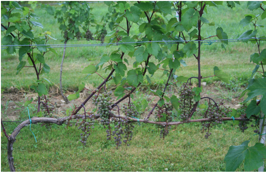
Figure 4 - Gemme (buds) were thinned to leave 5. The tralci (shoots) that develop will bear grappoli (clusters of grapes) at the first couple of nodes - they are trained vertically by tucking them inside the pairs of catch wires as they grow.

When the tralci grow past the top pair of catch wires, they are pruned off to limit shading below.