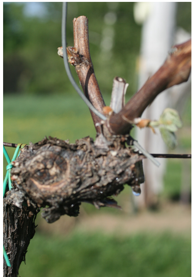
Figure 2 - Cornetto (renewal spur) on left; braccio (arm) from which tralci (fruiting shoots) will develop (right).

The braccio (arm) you have tied to the bottom wire of the trellis has buds that will develop, each producing a shoot and grappoli (bunches of grapes) that growing season. Once the tralci (shoots) have started to grow, remove all but 5. The 5 developing tralci (fruiting shoots) that are left should be spaced uniformly along the length of the braccio (arm).