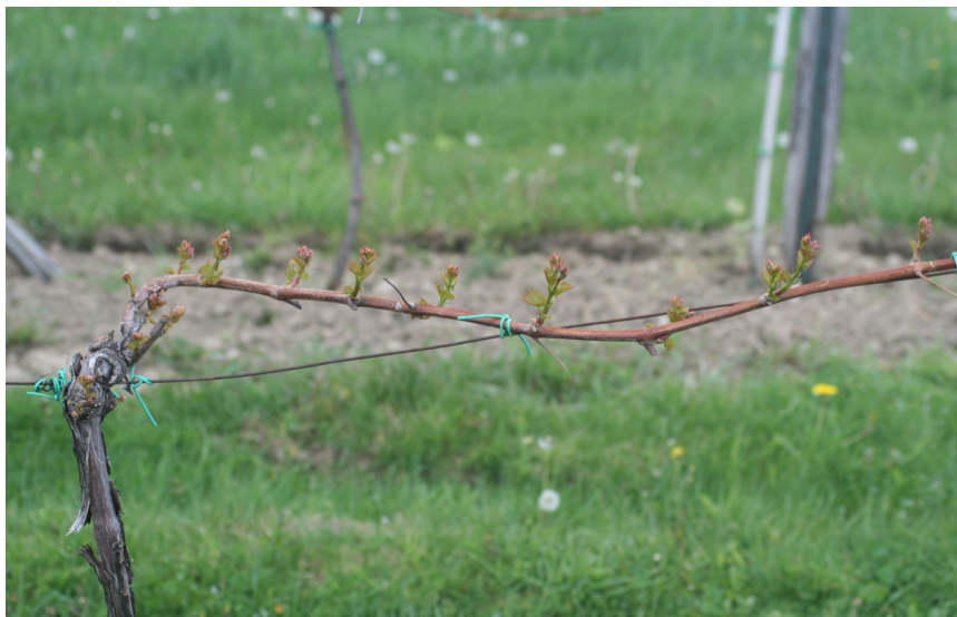
Figure 3 - Gemme (buds) along braccio (arm) need to be thinned to leave 5 after growth has started.

As the 5 developing tralci grow, they will produce flower clusters at the first 2-3 or perhaps more nodes and continue growing. These tralci should be trained in an upright position. This is accomplished by tucking them between the pairs of catch wires positioned above the bottom trellis wire as they grow.