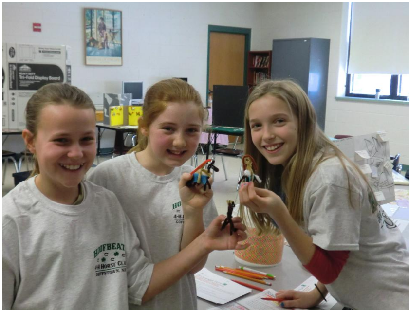
Above: Three Hillsborough County 4-H Members show off the horses they made in the Activity Room at the NH 4-H Horse Quiz Bowl Contest.