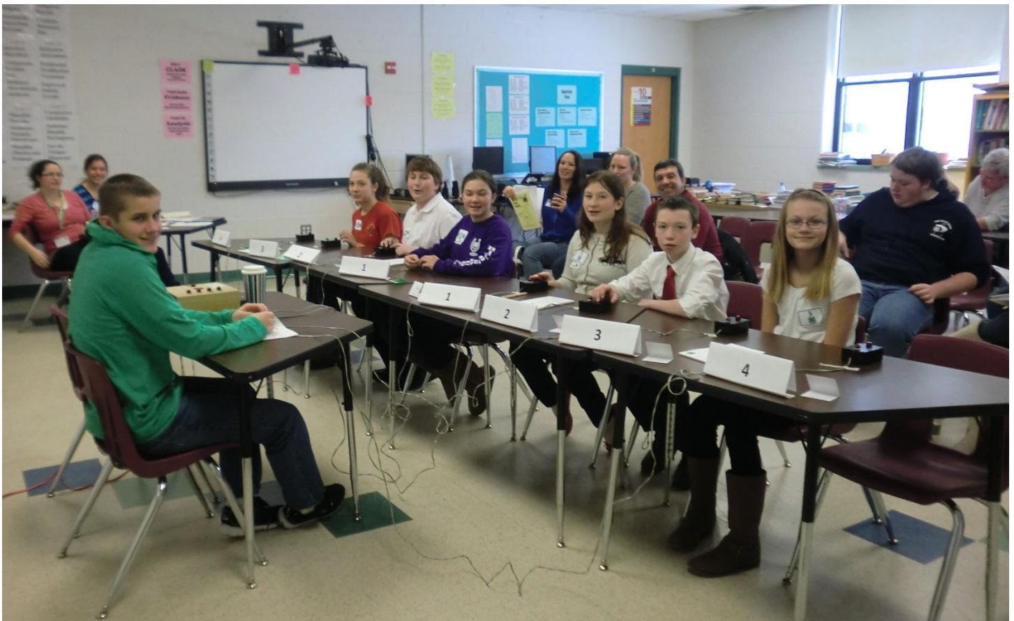
Above: Junior contestants ready to show their horse knowledge at the NH 4-H Horse Quiz Bowl Contest on January 17, 2015