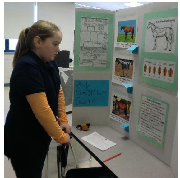
Right: A member learns about Horse Body Condition Score in the Activity Room at the NH 4-H Horse Quiz Bowl Contest