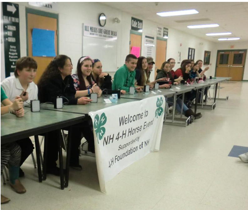
Left: A fun scrimmage at the conclusion of the NH 4-H Horse Quiz Bowl Contest