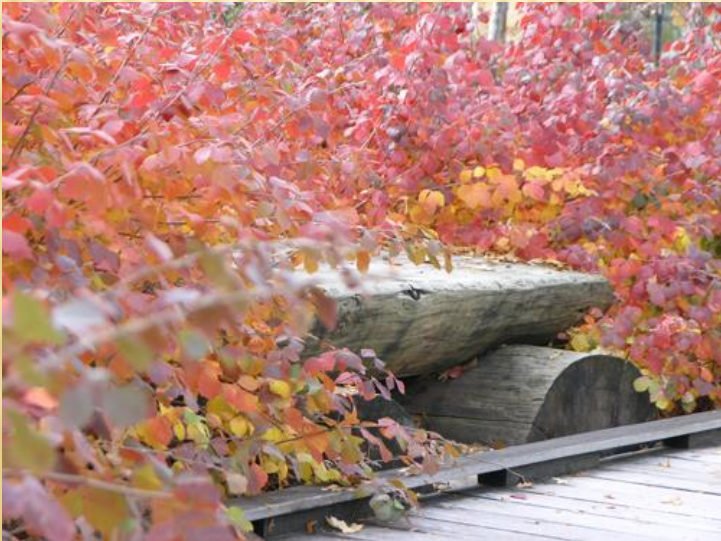
Rhus aromatic (Gro Low Sumac)