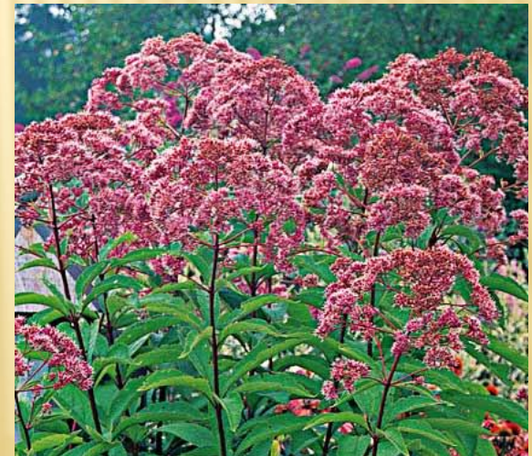
Eupatorium maculatum Gateway