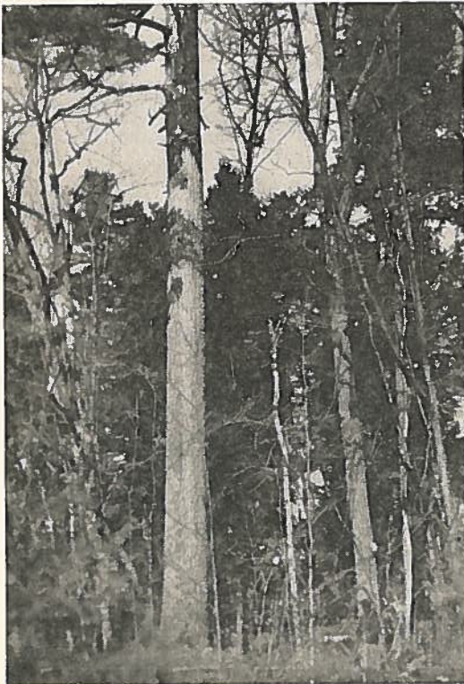
The Largest Tree, Bradford Pines Reservation

Bradford Pines. Within a quarter of a mile to the west of the Boston and Maine Railroad Station in Bradford are located 22 of the largest pines in New Hampshire. These trees and 5 acres on which they stand were reserved by Davis and Symonds Lumber Company of Claremont when they operated the lot several years ago and were deeded as a gift to the state. These trees have been carefully examined