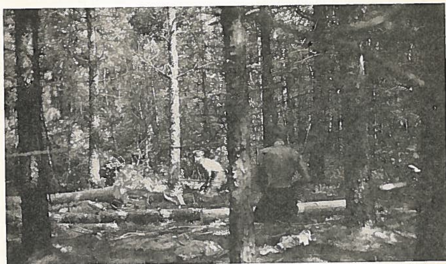
Highway Posts from Plantation Thinning, Mast Yard State Forest

9. Craney Hill — Some roadside clearing was done in preparation for establishing a forestry demonstration area. The wood was utilized for charcoal at the Fox Forest. Weeding, releasing and pruning of plantations is to be continued.