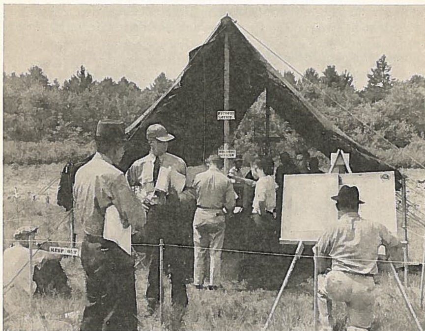
Training Organization for Large Fires

This training has shown results in less area burned, smaller fire bills and fewer second-day fires. However, with some annual turnover of personnel and with such a broad field of fire suppression training and with so little money available for town reimbursement, the same