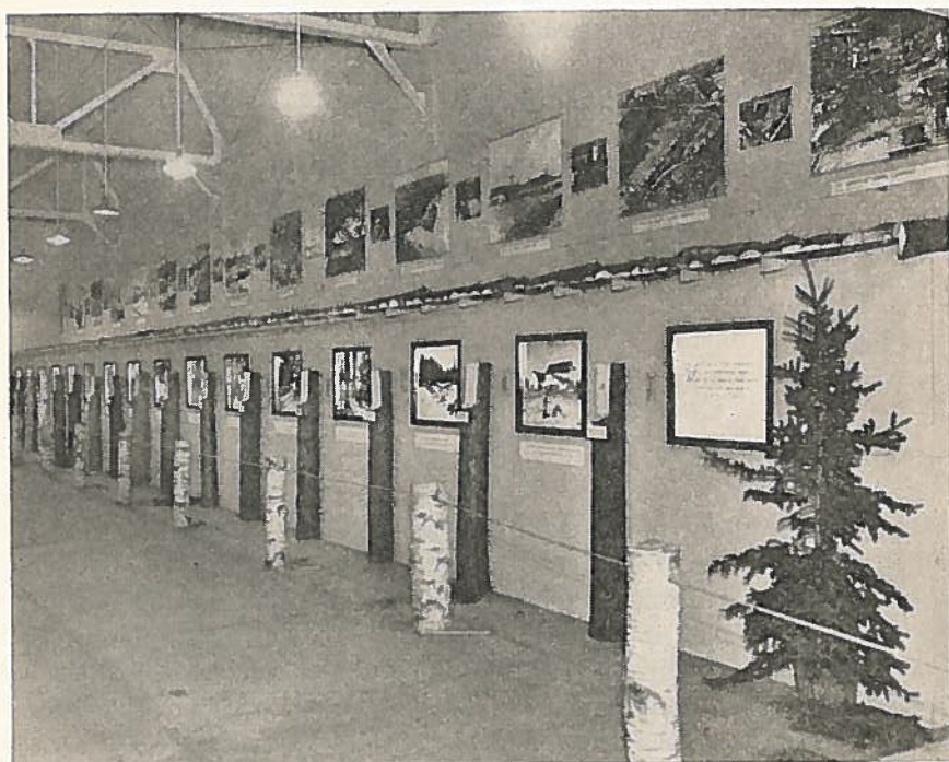
County Forester Exhibit, Eastern States Exposition

At the present time New Hampshire has 8 county foresters. Since the present county forestry program has been in operation — November 1, 1945 to the present — they have given on-the-ground assistance in management and marketing to more than 8,500 woodland owners and mill operators. The records show that on 2,260 woodland holdings