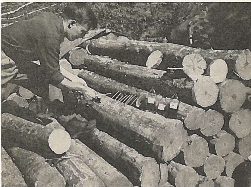
Testing Penetration of Wood Preservatives, Mast Yard State Forest

Further improvement of plantation edges is planned with a commercial operation of hardwoods, including oak, ash and basswood. This cutting will release suppressed trees at the boundaries of the plantations. Thinning of pine plantations is also contemplated.