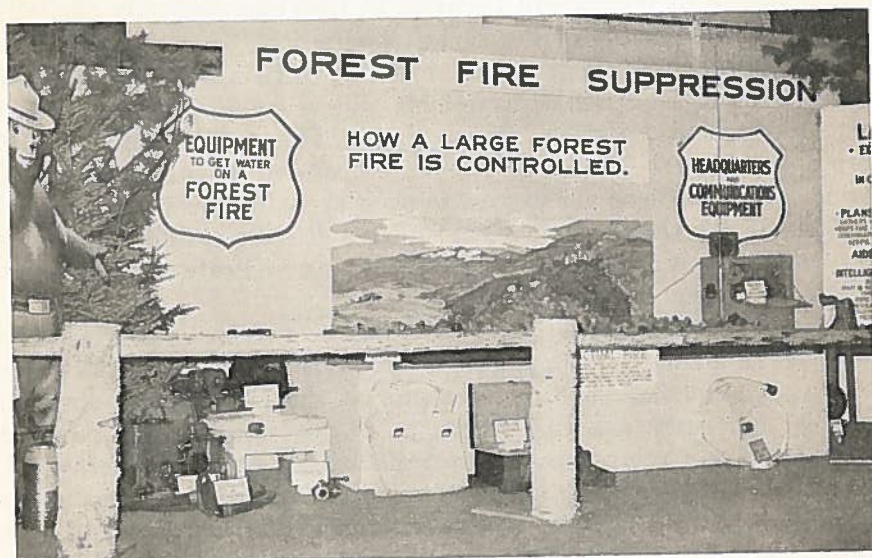
Part of Exhibit at Eastern States Exposition

The central piece was a steel-framed lookout, towering into the roof trusses, accessible by a wide stairway. (This tower has since been erected on Cannon Mountain where it will serve as a much needed lookout for that valuable scenic area). Inside the tower was a modern fire finder, maps and two-way radio. Surrounding the tower and separating it from the exhibits was a stand of varied evergreen and hardwood