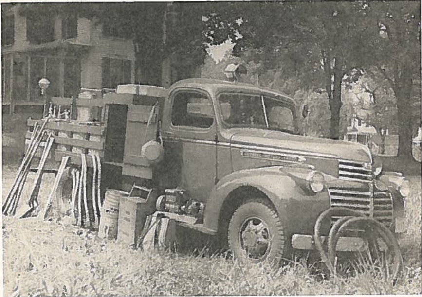
Town of Bristol Forest Fire Truck and Equipment

tion and operators are charged to the town calling for aid. Present locations are Portsmouth, Exeter, Pelham, Milford, Keene, Weare, Canaan, Rochester, Boscawen, Bear Brook State Park in Allenstown, Bristol, Rumney, Lisbon, North Conway, Berlin, Groveton, Colebrook and at the Flume and Tramway in Franconia Notch. In addition five trucks with boxes of tools for 100 men and a portable pump and hose.