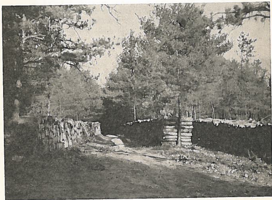
Pine Pulpwood Operation, Bear Brook State Park

Bear Brook — Selective cutting of pitch pine pulpwood will continue indefinitely. Approximately 50 acres of planting will be necessary. Operations are now centered along Podunk Road, Smith Pond Road, and the so-called Hayes Farm lot.