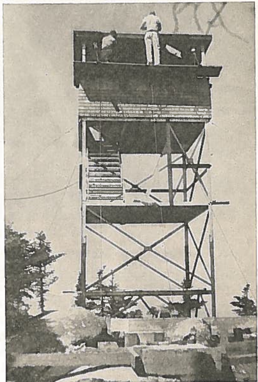
Cannon Mountain Lookout Construction

In order to provide lookout coverage for the area in the north end of District Four and a much needed radio dispatch point for the whole