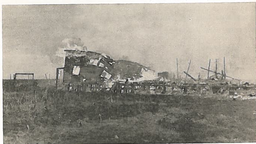
Buildings Destroyed by Grass Fire

Attendance by all members of the service at meetings of the ten forest fire wardens associations and active participation in the programs have been stimulating and informative on both sides. These meetings present an opportunity to show films, give wardens the latest information, and discuss administration, forest fires and forestry items. The recommendations of the Federation of Forest Fire