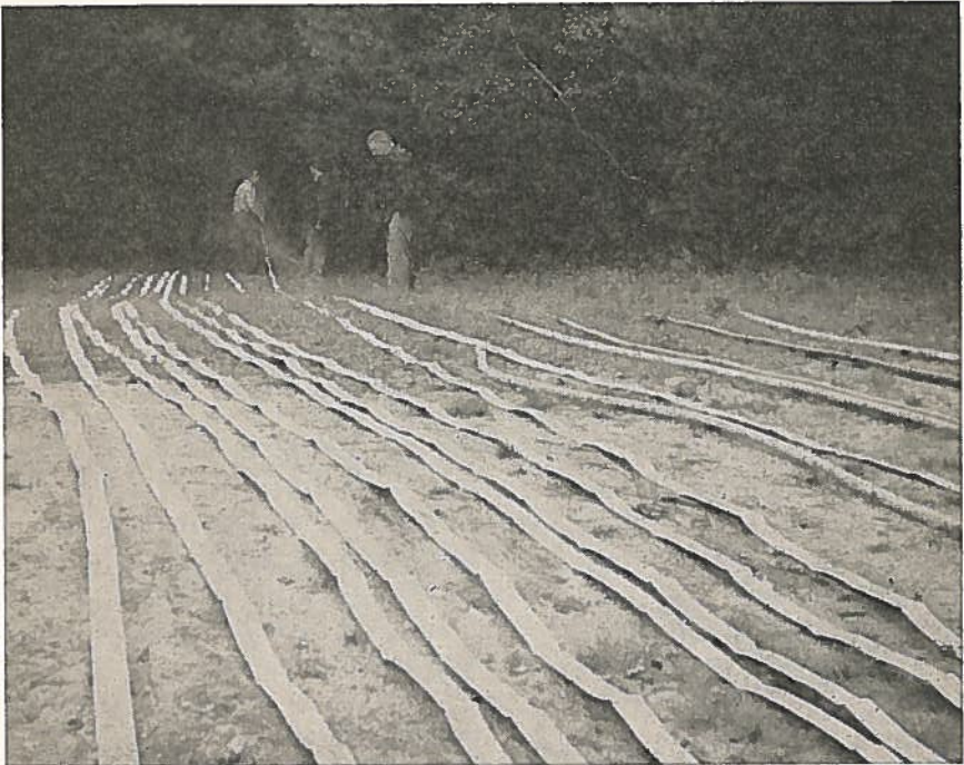
Inspecting 1½ inch Linen Fire Hose

sisting of anemometer, rain gauge and fuel moisture scales were purchased and four sets of iron-framed copper-screened shades and pipe anemometer supports were constructed in the shop. Twenty-four A. M. Motorola two-way radios were secured secondhand at a fraction of their original cost. Eight portable link sets were obtained at a nominal cost from the Maine Forest Service. A six-volt motor generator unit