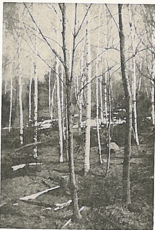
Thinning in Paper Birch— The State Tree

The county and consulting foresters can work together and bring about real accomplishments in getting forestry applied in the woods. The job of getting good forest management practiced on small forest holdings is a big one, and the combined efforts of both public and private foresters are important.