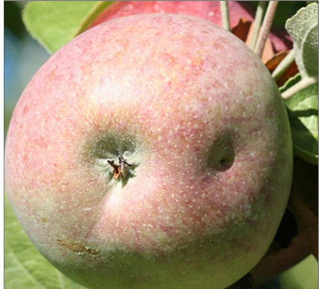
Tarnished Plant Bug injury.