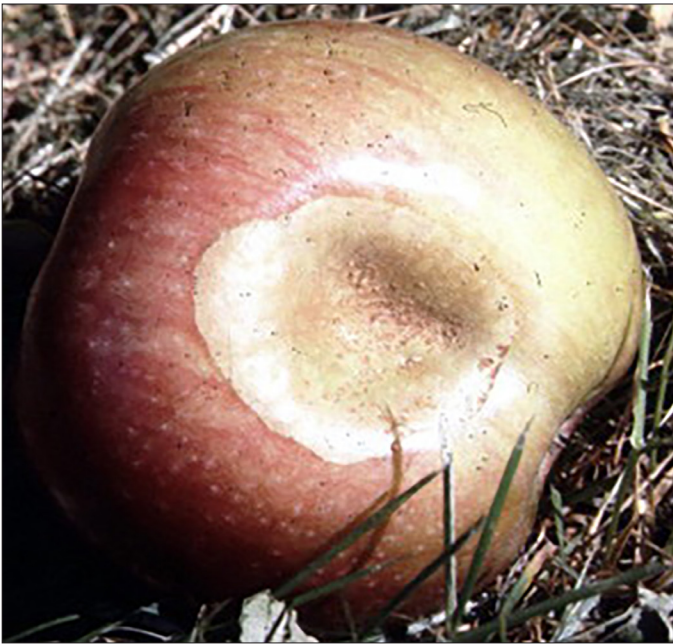
Green Fruitworm injury.