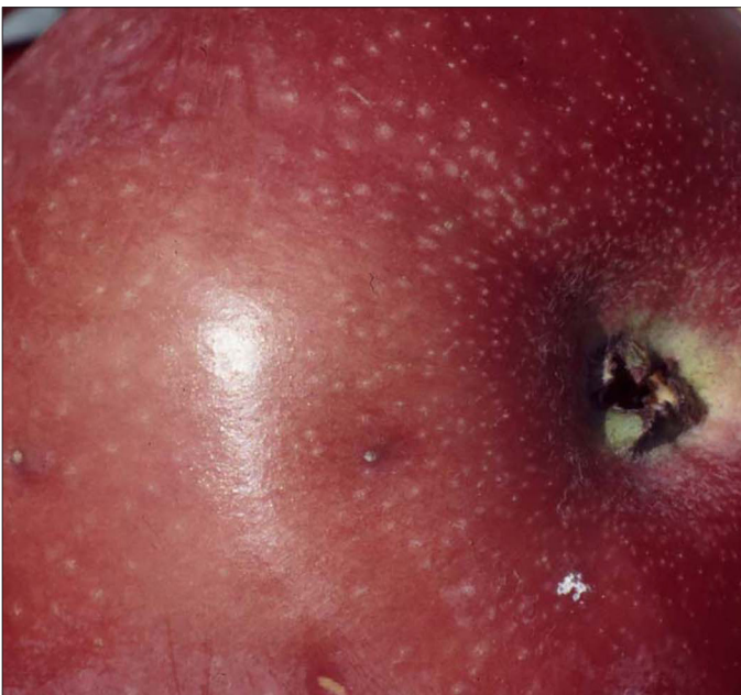
Apple Maggot “stings” are difficult to spot.

Apple Maggot: Most AM injury is hidden from our view, not visible without slicing open the fruit. Sometimes it is visible as a very slight indentation, accompanied by a tiny hole (often need a 2-10X hand lens to confirm), often accompanied by very slight darkening of the skin around the puncture. Sometimes there is a tiny bit of whitish surface exudate, where juice dried up. (see right puncture in photo below at left) The hole is less than 1mm across, so this is often hard to spot. Much AM injury is missed by visual examination of the surface. Fruit cutting is necessary to get a more reliable indicator of AM attack. AM injury is hard to identify. I see two suspect “stings” in the left fruit below; 3 or more on the fruit at right, below.