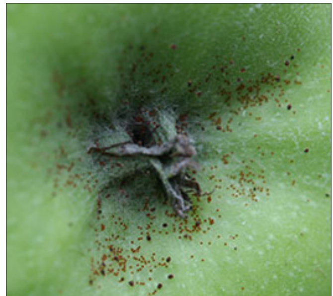
Eggs and adults of European Red mites.

Green Fruitworm: A large, deep, irregular, grainy patch is likely to be from green fruitworm. The caterpillar ate part of the fruit early in the year. The injury healed over, leaving a scar that is sometimes very deep, sometimes shallow. This damage is rare on most conventionally-managed blocks, but common in organic or backyard trees. (photo, next page).