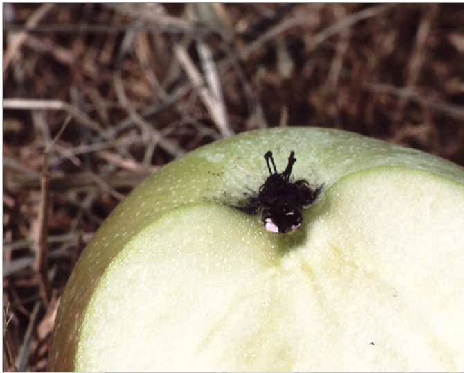
Comstock Mealybug (white spot in sooty calyx).