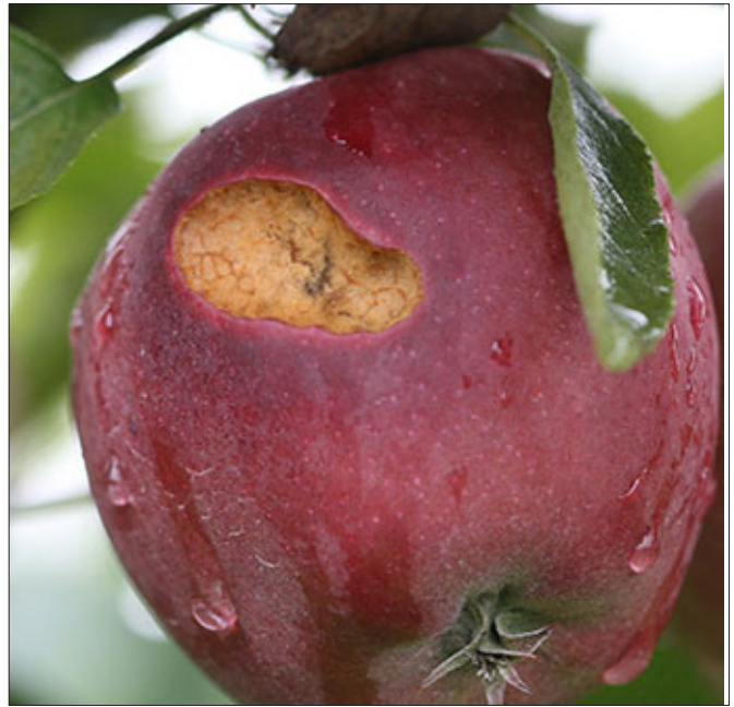
Climbing Cutworm injury.

Climbing Cutworm: A recently chewed hole (up to 1/2 inch across) could be from climbing cutworms, or occasionally other insects. Usually, it is toward the bottom of the fruit. In the photo above, it is closer to the top.