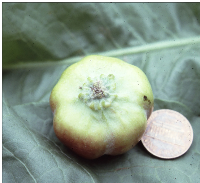
Rosy apple aphid.