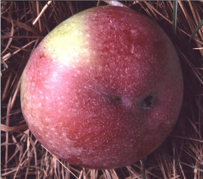
Tarnished Plant Bug injury.