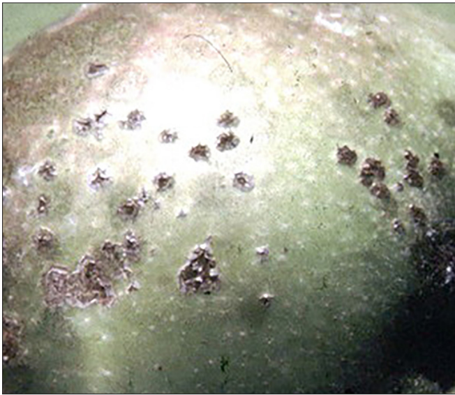
Apple scab photographed in September.