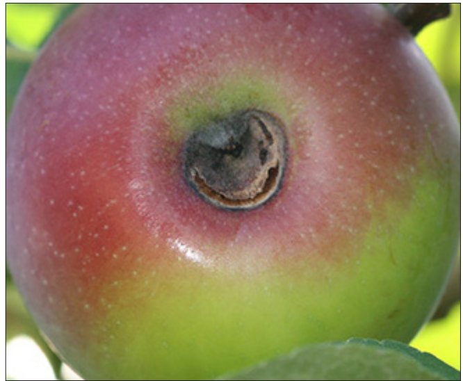
Calyx End Rot.

Sooty Blotch: Without magnification, sooty blotch looks like a gray spot (could be several) on the fruit surface. Viewed with a 10X lens, it looks like a series of black spots. Often it is with flyspeck. It is in the photo above, at the bottom left (with a little flyspeck showing, too).