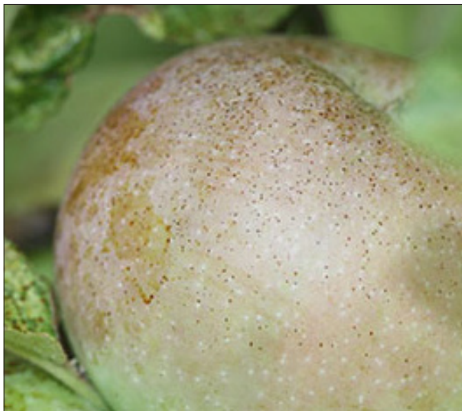
White Apple Leafhopper injury.

Mites: Eggs of European red mite are sometimes obvious as a group in the calyx end of the fruit. They are round, brick red in color. Occasionally (especially later in harvest season) I find groups of bright orange mites on fruit --- these are the over-wintering form of another species: twospotted spider mite. In the photo (below left), several dark, oval European red mites are present below the calyx, in addition to the (smaller) eggs. Mite eggs are easiest to spot on green or yellow-skinned fruit.