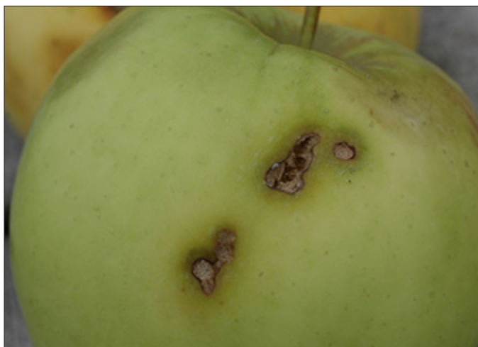
Oblique-banded Leafroller injury on Ginger Gold apple.

Oblique-banded Leafroller: We are starting to see this, but still quite rare in NH. It looks like the beginning of some RBLR injury, but is usually on the exposed face of the fruit, not under a protected leaf. The photo at left below is a damaged Gingergold fruit from southwestern New Hampshire in 2008.