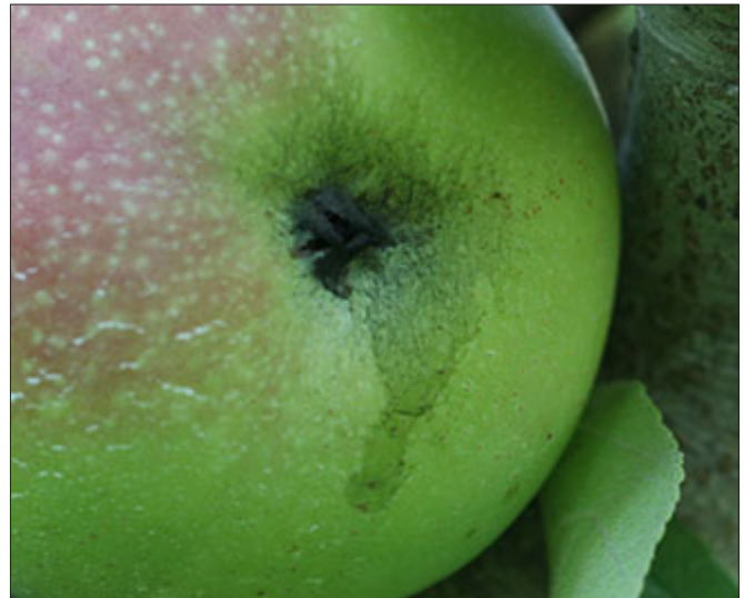
This sooty calyx is evidence of Comstock Mealybug inside.

White Apple Leafhopper: There are shiny brown flecks of excrement on the upper side of the fruit, below leaves on which the leafhoppers were feeding. Leaves immediately above the affected fruit show white stippling. Heavy rain washes the fruit clean.