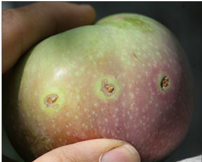
Codling Moth injury, August.

Codling Moth: Codling moth injury on fruit is uncommon in conventionally managed orchards. Reddish-brown frass (fecal pellets), usually at the calyx end, projects out of the tunnel. Codling moth larvae usually tunnel to the core and do some feeding on the seeds, before leaving the fruit and pupating. Occasionally a tunnel is in the stem end or side of the fruit. It could be a tiny blemish, but will show frass pellets coming out of the hole. Larvae can be distinguished from Oriental fruit moth by looking for an anal comb... a tiny, dark comb-like structure very low on the rear end. Both photos below show codling moth damage.