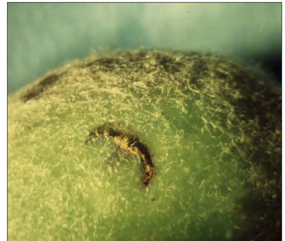
Plum Curculio egg-laying scar on green apple.

Redbanded Leafroller: Recent surface chewing that remove the skin and a small amount of flesh, and is hidden from light by overlying leaf, or (especially in Cortland) another fruit set immediately behind. Redbanded leafrollers must have shelter from light. The caterpillar is often still present in early September, chewing away. Now that oblique-banded leafroller is damaging in some NH orchards, this could also be from OBLR.