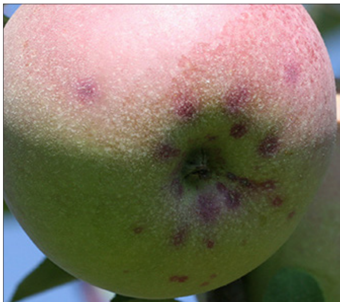
San Jose Scale.

San Jose Scale: The scales themselves are tiny, round, raised and grayish. At the time of harvest, those found on the fruit are roughly 1mm across. They would be hard to spot, except a reddish ring forms around each scale. They are most common toward the calyx end. Where you find one, you'll usually see others. See photo below.