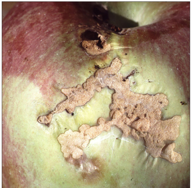
Redbanded Leafroller injury.