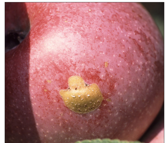
Plum Curculio injury as it appears at harvest time.