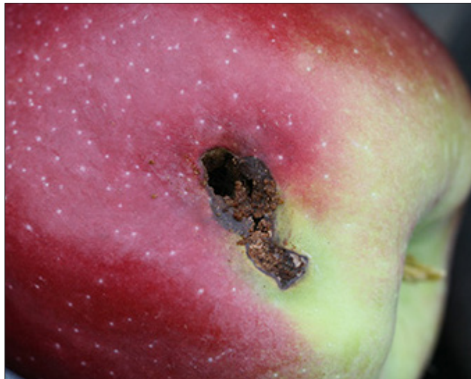
Codling Moth injury, August.

Lesser Appleworm: LAW injury is very similar to codling moth damage, with the same red-brown fecal pellets. LAW tunnels are usually shallow, and don't go to the core. They often arise on the side of the apple, rather than being hidden in the stem end or calyx end. If you find the caterpillar, you can distinguish this species from CM by looking for the anal comb with a microscope.