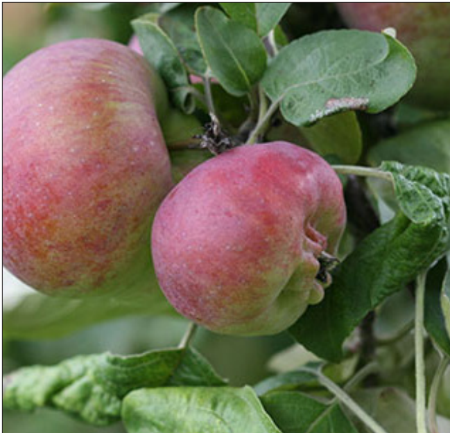
Rosy apple aphid injury.

Stinkbug: I see what I call stinkbug injury rarely on NH apples, but it will increase once brown marmorated stinkbug builds up in New Hampshire. It is usually a visible puncture, often with a slight depression around it. Sometimes there is slight discoloration there. Cutting into the flesh usually reveals a brown, corked area of flesh. Very careful vertical cutting may reveal the vertical hole made by the mouthparts, visible under a microscope. (Stinkbug injury photo, below right).