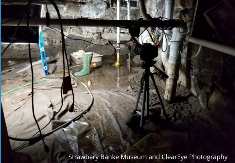
Strawbery Banke Museum and ClearEye Photography