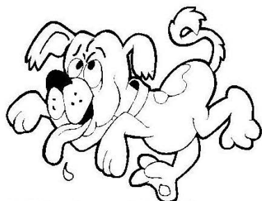
1. Playing with pets.