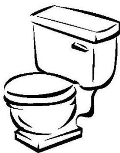
2. Using the bathroom.