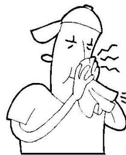
3. Sneezing, blowing your nose or coughing.