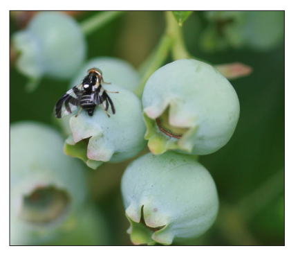
Adults are most abundant July 1<sup>st</sup> to 15<sup>th</sup>. Credit: Alan T. Eaton.