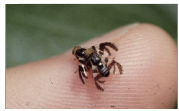
Adult blueberry fruit flies mating.

The blueberry fruit fly can be a serious pest of blueberry in New Hampshire.