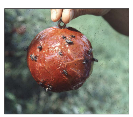
Red sphere sticky trap used to monitor blueberry fruit flies.

Highbush plantings that are kept well-picked usually have few problems with blueberry fruit fly.