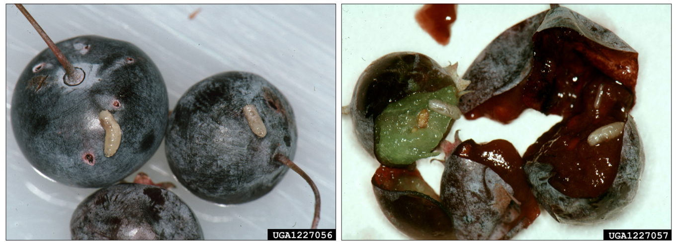
Blueberry fruit fly maggots on and in blueberries.

Consult your county Agricultural Field Specialist for specific recommendations.