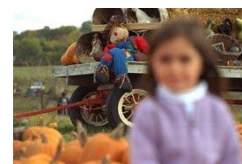
Subject not in focus

If subject is not in the center of the picture, you need to lock the focus to create a sharp picture. Most auto-focus cameras focus on whatever is in the center of the picture. But to improve pictures, you will often want to move the subject away from the center of the picture. If you don't want a blurred picture, you'll need to first lock the focus with the subject in the middle and then recompose the picture so the subject is away from the middle. Usually you can lock the focus in three steps. First, center the subject and press and hold the shutter button halfway down. Second, reposition your camera (while still holding the shutter button) so the subject is away from the center. And third, finish by pressing the shutter button all the way down to take the picture.