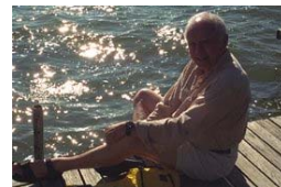
Subject is dark

Bright sun can create unattractive deep facial shadows. Eliminate shadows by using flash to lighten the face. When taking people pictures on sunny days, turn flash on. You may have a choice of fill-flash mode or full-flash mode. If the person is within five feet, use fill-flash mode; beyond five feet, full-power mode may be required. With a digital camera, use the picture display panel to review results.