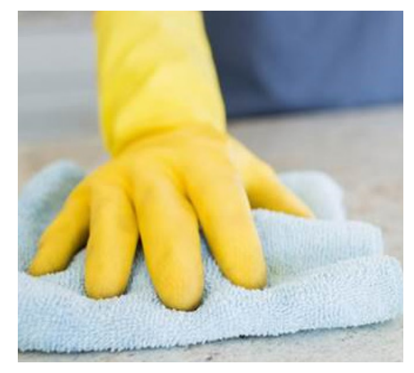
Washing counter with gloved hand.