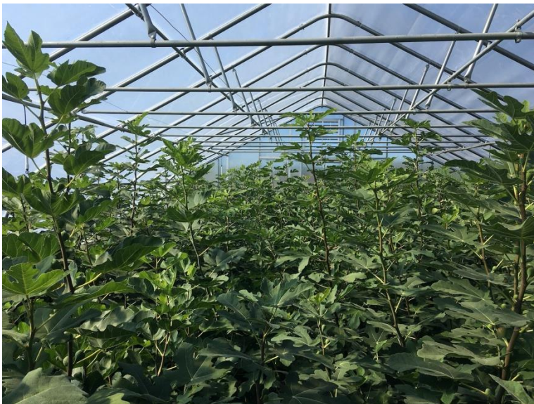
High tunnel figs in October, near the end of the harvest season in second year.