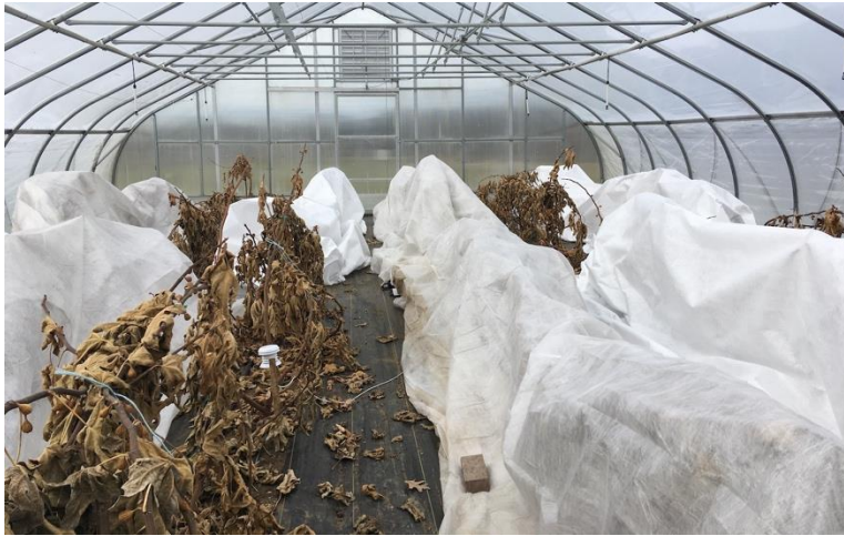
High tunnel figs showing protection methods during January: unprotected, heavy rowcover, and winter blanket (front of photo from left of center to right).