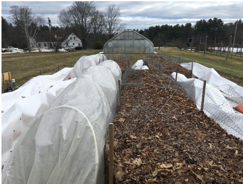
Illustration of winter protection treatments for outdoor figs: winter protection fabric (far left), low tunnel (just left of center), and leaf cage (center of photo).

With any questions, please contact the author at: becky.sideman@unh.edu or 603-862-3203. You can follow the Sideman Lab's work on Instagram @unh_sidemanlab .