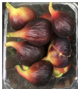
Ronde de Bordeaux