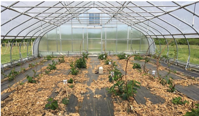
High tunnel figs in early May of their second year, beginning to leaf out.