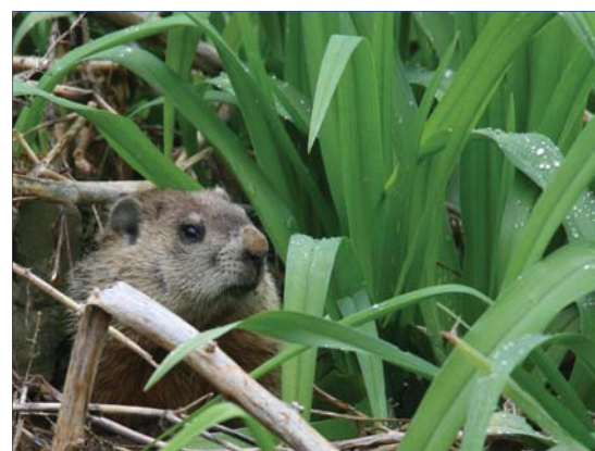
Woodchucks are day-active animals that feed on a wide variety of plants.