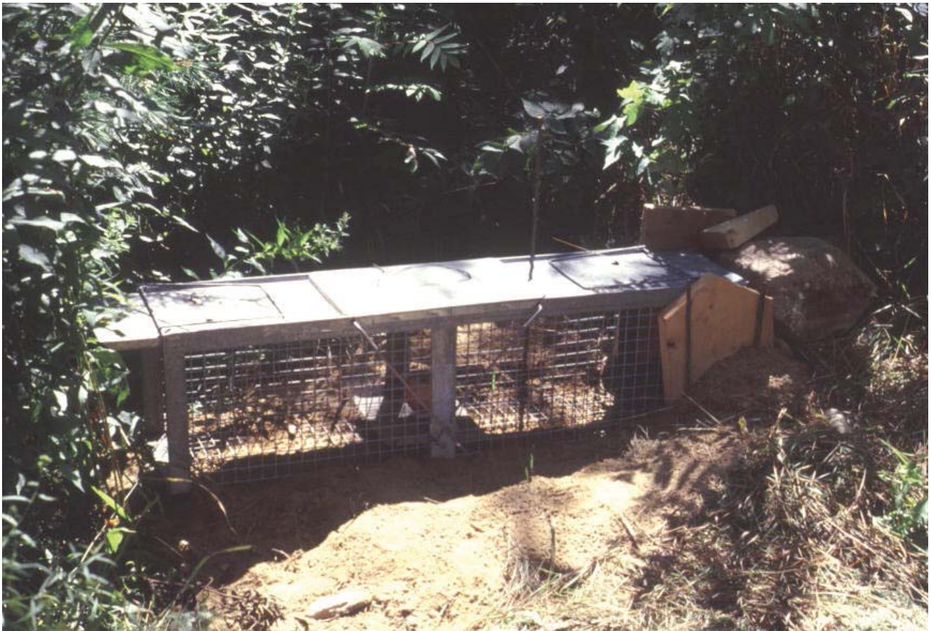
An effective method of trapping without bait is to place the trap with a barrier so that the animal has no choice but to go through the trap, when it exits its burrow. A live trap permits the release of non-target animals.

For those people vaccinated against rabies, live trapping might be less risky. The most effective technique is to place the trap directly at the burrow entrance, and use a barrier of boards or other material to direct the animal into the trap. No bait is needed in this situation. The animal just walks out of its burrow and into the trap. Trap placement elsewhere is much less effective, but sometimes the woodchuck can be enticed inside with fresh apple slices or fresh carrots or lettuce. Change baits daily.