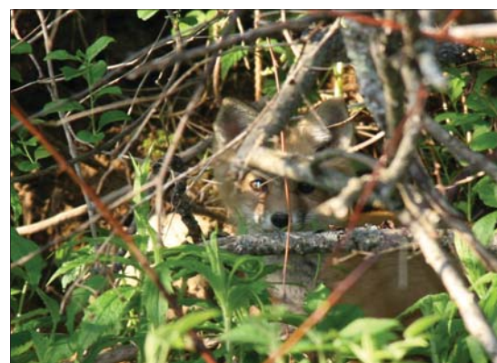
Many animals use burrows started by woodchucks, including this red fox.