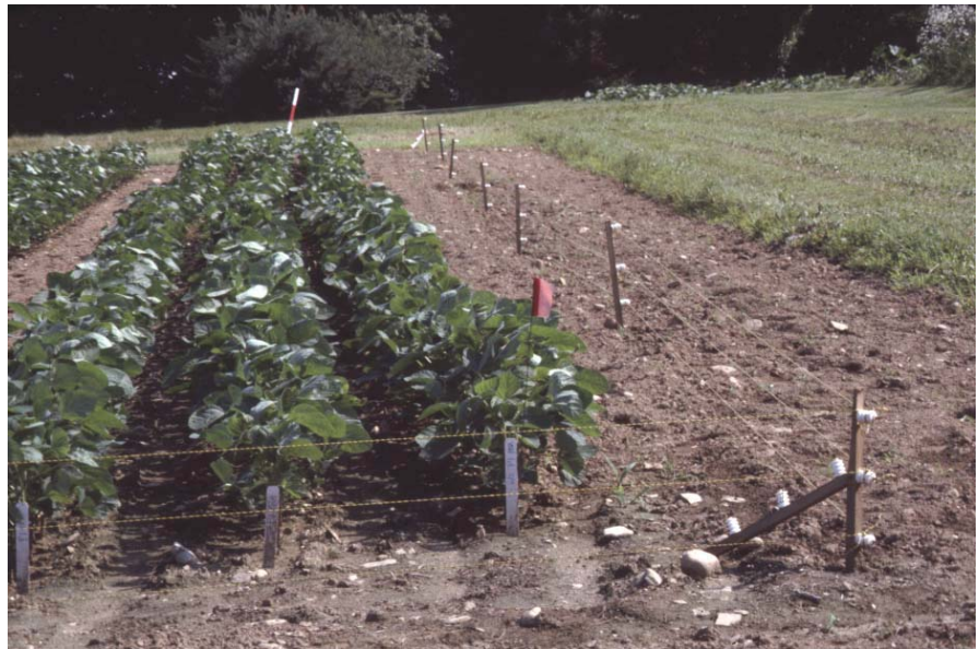
Electric fencing has kept this research plot entirely free of woodchuck damage. Note that weeds must be kept from growing into the fence.

Before we paint them as entirely bad, we should recognize how woodchucks are valuable.