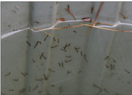
Mosquito larvae in a rain barrel.

The mosquito larvae must feed on the Bti particles. Mosquitoes in their pupal or adult stages won't be killed when the stuff is sprayed into the water. Using Bti has several major drawbacks: