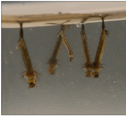
The larvae of all mosquitoes live in water. These are Ochlerotatus communis .