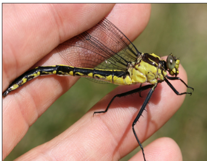
This dragonfly species is named black spinyleg.

As for dragonfly larvae, theoretically they might help, but any New Hampshire water body appropriate for dragonflies is already inhabited by dragonflies. That goes for other mosquito larvae predators. We don't need to import them, because they're already here.