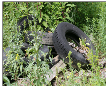
Discarded tires left outdoors catch rainwater, and serve as breeding sites for many species.