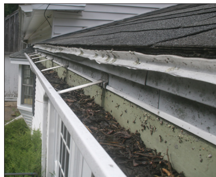
Gutters that are plugged with debris retain water for a long time, and thus serve as mosquito breeding sites.

Reducing water-holding containers around the home (poorly adjusted gutters, bird baths, old tires, and other containers that fill with rain water) isn't a very effective tool for managing EEE, since very few mosquitoes that spread EEE breed in such habitats. One possible exception: Ochlerotatus triseriatus , a common tire breeder.