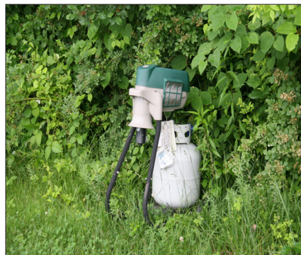
This is a commercial mosquito trap, called the "Mosquito Magnet".

If you have a water garden, consider adding small fish from the start. Be sure to follow state laws and regulations for introducing fish into your water garden (or backyard pond).