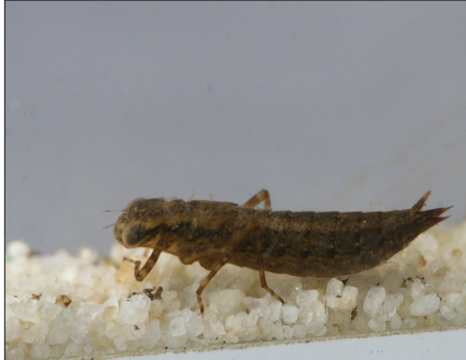
This is a nymph of a darter, one of the dragonflies. They are predators living in water.

However, reducing water-holding containers around the home will definitely help reduce the risk of West Nile Virus, another mosquito-borne viral illness, caused by different mosquito species from those that cause EEE. (See below for more information on WNV.) Also, it can significantly reduce the nuisance of mosquito-biting around your home.