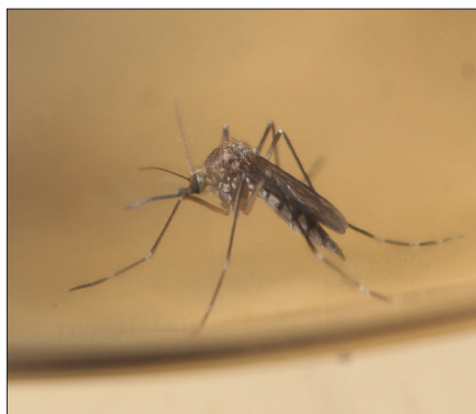
This is a freshly emerged adult of Ochlerotatus communis .

Piperonyl butoxide works as a synergist , which means that adding it greatly increases the effectiveness of the insecticide.