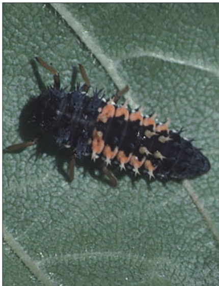
Multicolored Asian Ladybug larva.

We do not recommend controlling them by spraying insecticides on or inside buildings.