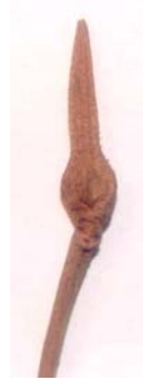
V. nudum var. cassinoides

nannyberry ( V. lentago ): scales of flower bud meet in center, buds brownish