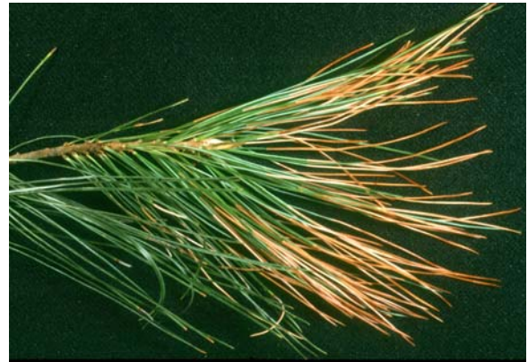
Figure 1. Diagnostic symptoms of Canavirgella Needlecast. Note reddish-brown color of infected needles.

the symptoms are usually confined to current-season needles. Tips of infected needles first appear yellowish-tan and develop a distinct reddish-brown color by late August.