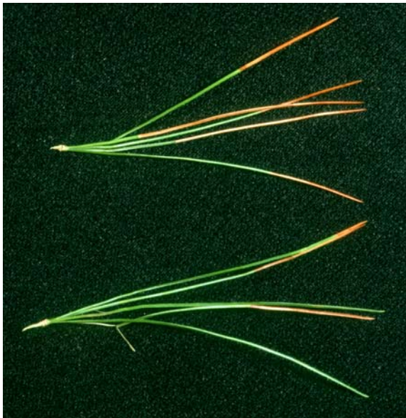
Figure 2. Individual needles in a fascicle show different levels of browning.

attached to the tree. Symptomatic portions of individual needles may break off before the fascicles drop during periods of normal needle shedding. The general symptoms of this needlecast have frequently been confused with those associated with acute ozone injury and other needlecast diseases. However, with ozone, symptoms usually develop on all of the needles within a fascicle and needles exhibit the same extent of injury.