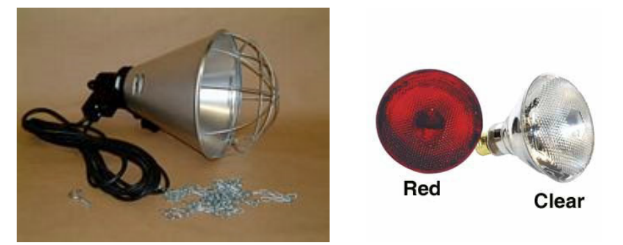
Examples of light fixtures for your brooder.

In the absence of a thermometer, monitoring chick behavior can help you determine if the temperature in the brooder is suitable for proper chick health. Chicks that are cold will huddle together under the heat lamp. Chicks that are too warm will move as far from the lamp as the brooder ring will allow. If the brooder area is drafty, the chicks will move to one side of the brooder in an attempt to escape the draft and still keep warm. If the temperature is just right the chicks will be evenly distributed with in the brooder area, softly chirping and pecking around.