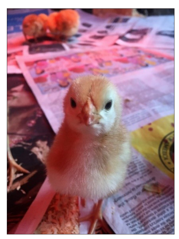
Healthy chicks in an environment that is fit for brooding.