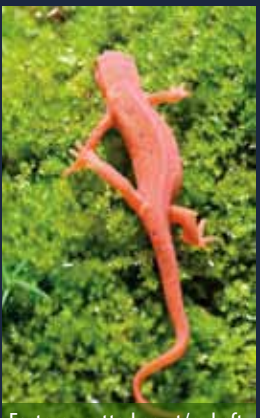
Eastern spotted newt/red eft