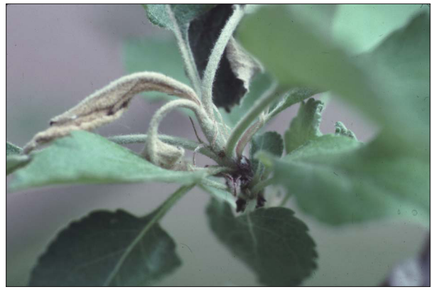
Pith moth damage to new shoot in spring