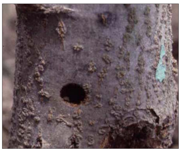
Roundheaded apple-tree borer exit hole