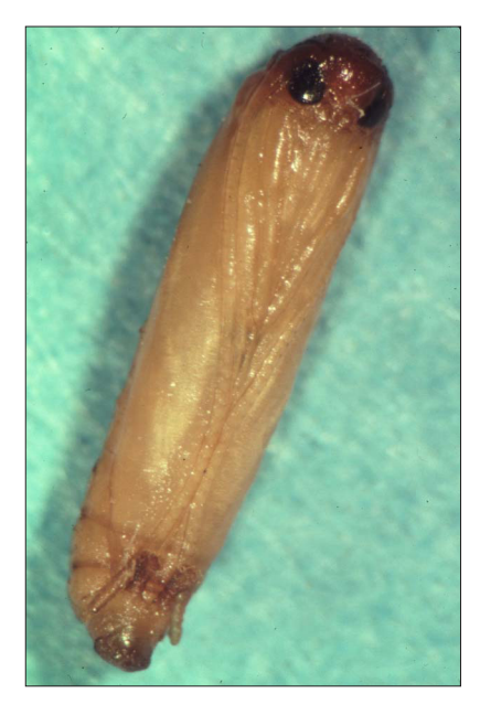
Pith moth pupa