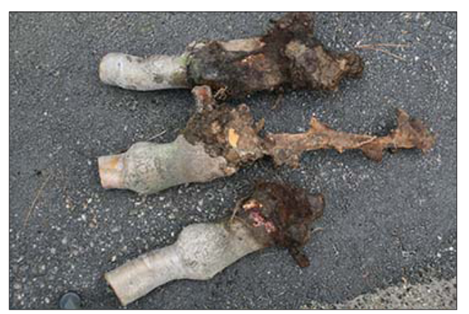
Broadnecked root borer damage to 8-year-old apple trees