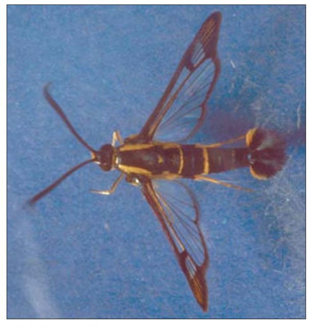
Adult dogwood borer

We haven't determined how many borers it takes to make treatment worthwhile, but observations suggest that heavy infestation reduces tree vigor and productivity. There are trunk sprays available for commercial growers, but backyard growers have access to fewer products. In commercial orchards, early July is the most effective application time.