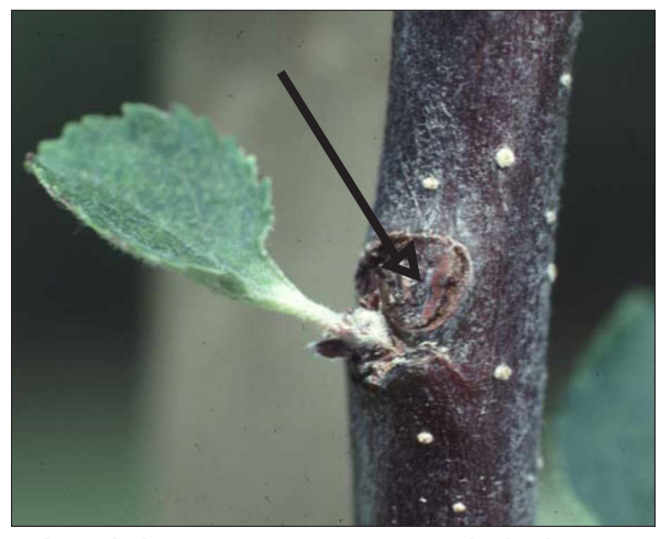
Pith moth damage (over winter site under bark)