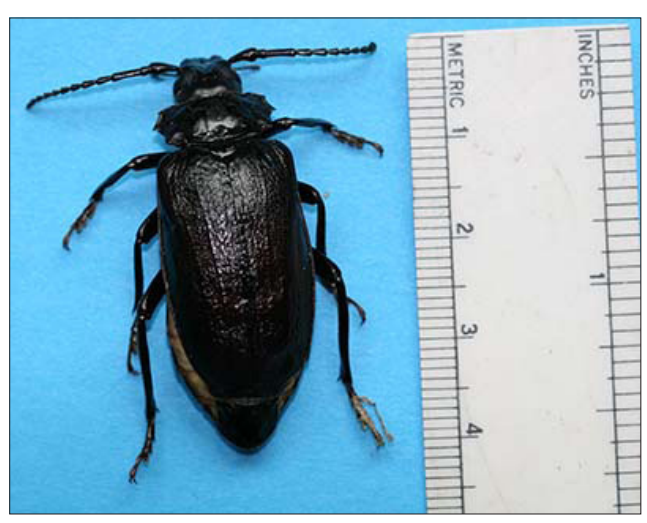
Adult broadnecked root borer

We don't yet know how to prevent attack by root borers. The damage is too new and limited in location. Perhaps soil type and rootstock might affect attack. We have found two other reports of injury to apple trees; one in Connecticut, the other on Long Island, New York.