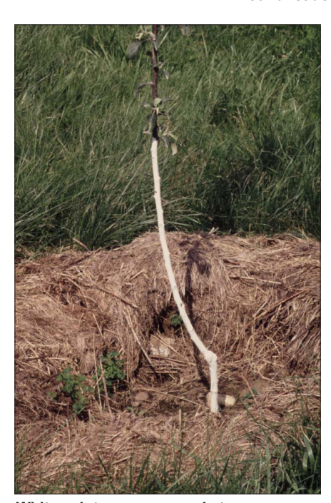
White paint on young apple tree