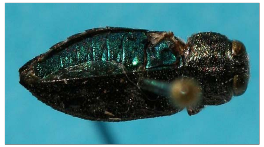
Adult flat headed apple-tree borer

The young larvae create winding tunnels just under the bark on the sunny sides of branches. As they get older, they bore more deeply into the wood. Tunnels are tightly packed with fine "sawdust" or (in wood) fibrous material. A single larva can sometimes girdle a young tree. The life cycle takes one year.