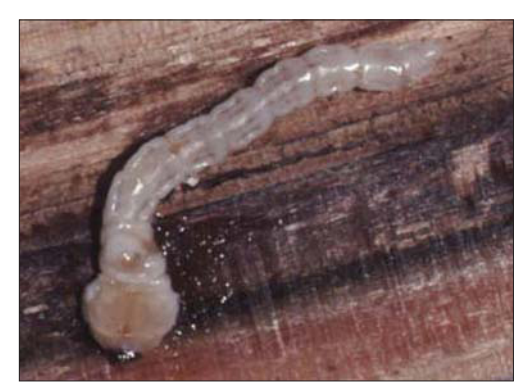
Flat headed apple-tree borer larva