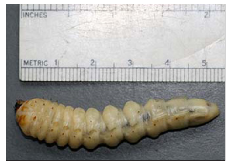
Broadnecked root borer larva

This very large beetle is common in New Hampshire and was recently (2009) documented attacking apple trees here. True to its name, it doesn't attack above ground. It feeds on the roots of many common trees and shrubs, including species of Prunus , Malus , Acer , Quercus and others.