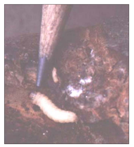
Dogwood borer larva and pencil

We haven't determined how many bark borers it takes to make treatment worthwhile, but observations suggest that heavy infestation reduces tree vigor and productivity.