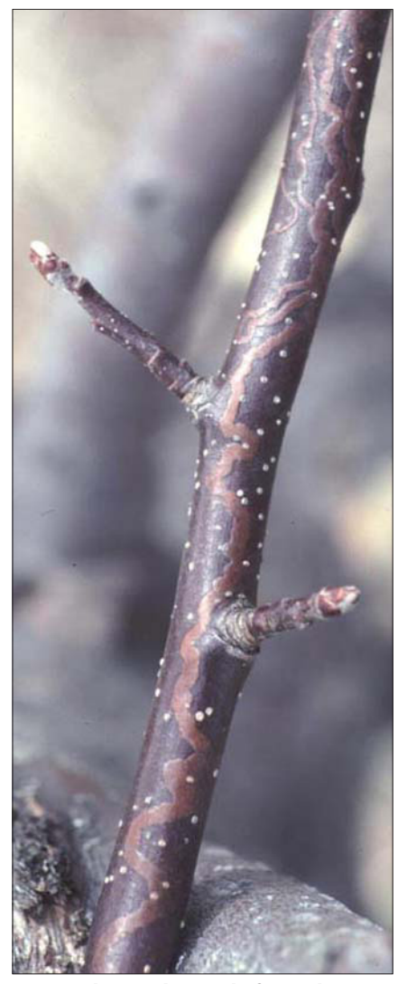
Twig with raised tunnel of FATB larva

Adults of FATB are strongly attracted to freshly cut live deciduous wood and brush, especially from logging or firewood operations.