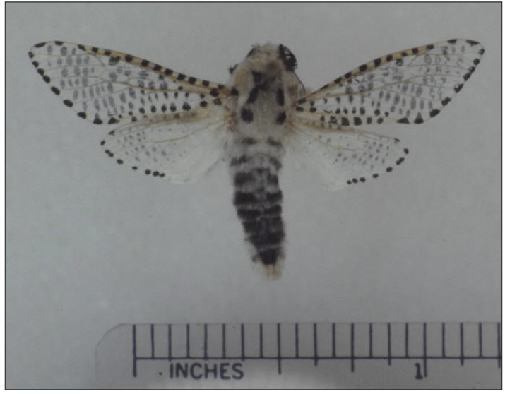
Adult leopard moth

Growers often locate a Leopard moth larva from the large, coarse pellets of frass that it has pushed out of its tunnel.