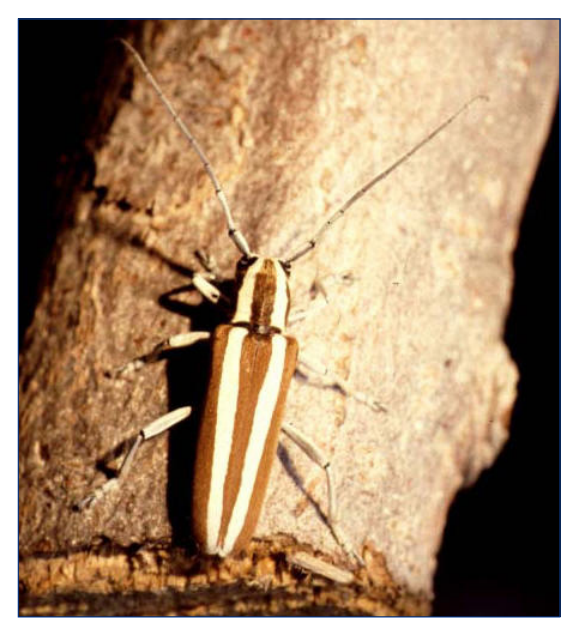
Roundheaded apple-tree borer on tree trunk

The adults spend a lot of time in apple foliage, and that may be one reason that we see relatively few RHATB problems in trees of bearing age on conventional farms (exposure to insecticides).