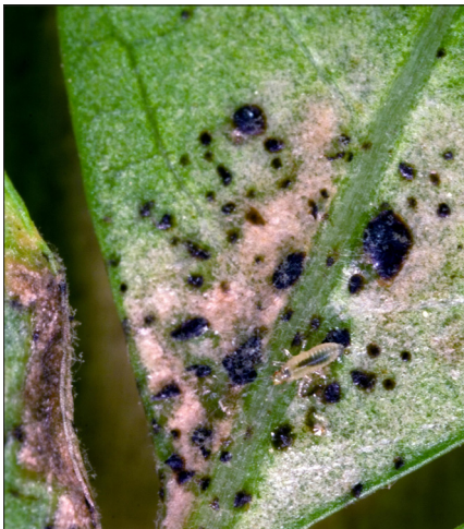
Western flower thrips adult and damage.