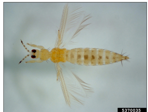
Adult western flower thrips.

The Western flower thrips is a devastating pest of ornamentals and the major vector for tomato spotted wilt virus.