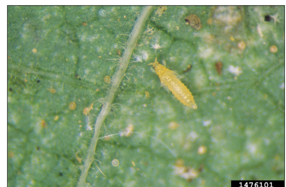
Immature form (larva) of western flower thrips.

The Western flower thrips is a devastating pest of ornamentals and the major vector for tomato spotted wilt virus.