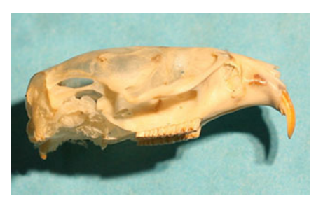
Vole teeth.