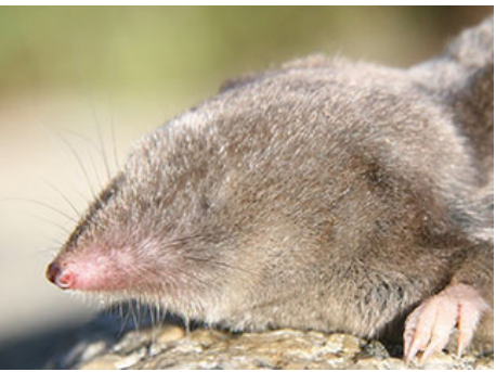
Northern short tailed shrew.