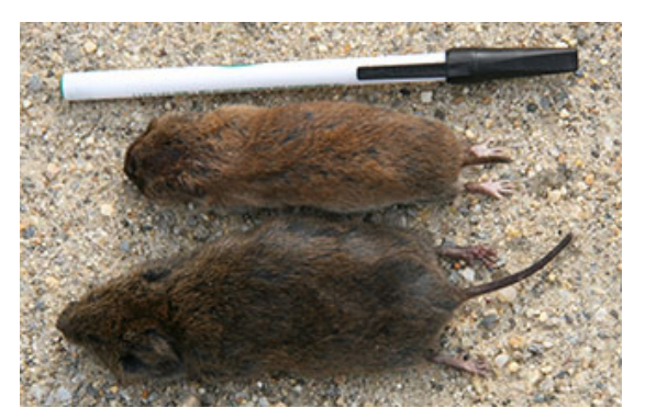
Pine vole (top, with short tail) and meadow vole (bottom, with long tail).