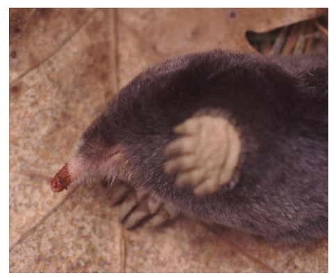
Hairytail mole.

Deer mice and white-footed mice are rodents that we sometimes see in orchards or in storage buildings. They have prominent eyes and very long, bi-colored tails which are white below and gray or brown beyond the fur on their heads. They are usually brown with white underparts. They have the usual tooth arrangement of all rodents (including voles): the front incisors are chisel shaped. Behind the incisors is a long gap with no teeth, then several grinding teeth at the rear of the jaw.