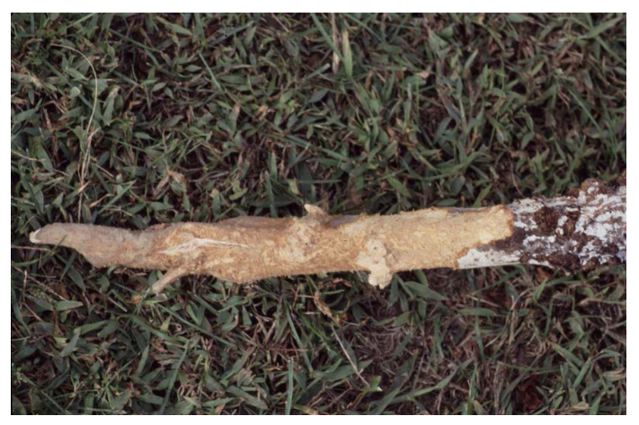
This young tree was completely sheared off by voles.

Most highbush blueberry plantings are mulched with various organic materials, and often the plant rows are several inches above the drive rows. Meadow vole girdling is uncommon in our highbush blueberries, except in situations with severe weeds in the rows. Underground in-row tunneling is quite common,