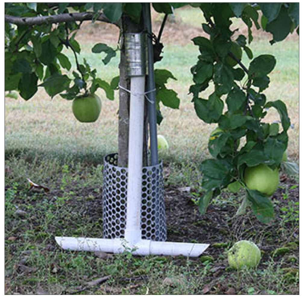
T-shaped pvc bait station.

If your rodenticide label allows it, bait stations can be made from 1 ½ inch diameter PVC pipe in the shape of a T, with a vertical section 16 to 20 inches high. These can be supported by a stake or tree trunk, with a tin can covering the top . This design allows you to place rodenticide after the snow falls, with minimal disturbance. This design can be even more effective if a small board or shingle is rested over one or both ends, thus creating a small roofed hiding spot. Unfortunately, this sometimes inter- feres with mowing operations. The T-stations are most likely to help for meadow vole, not pine vole.