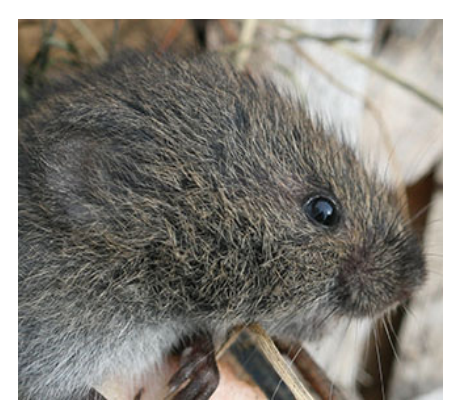
Meadow vole.

The pine vole is a fossorial species. That means it lives underground and spends very little time above ground.