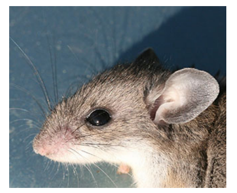
White-footed mouse.