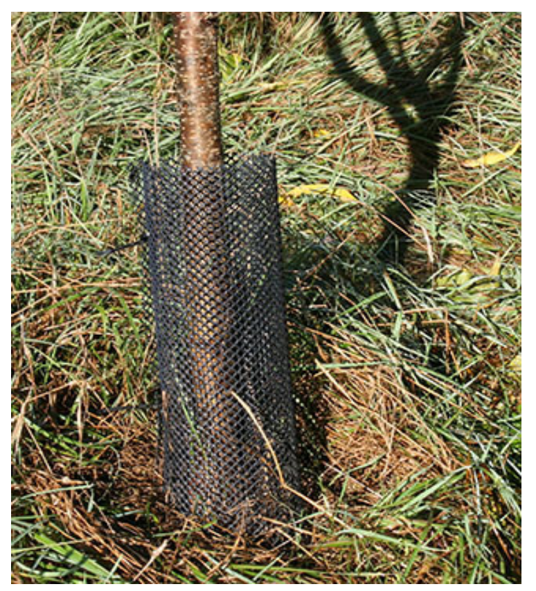
Plastic mesh vole guard.

Several rigid, perforated polyethylene or plastic mesh products are being promoted for use as tree guards. Use them in a similar way to galvanized hardware cloth (explained above). They are easier to cut from the roll, and easier to handle than wire guards, but some may break down by exposure to ultraviolet light and may have a limited life. Some are pre-cut to standard heights and widths. Costs of the plastic materials vary. A typical fall 2012 price was $130 for a 100 foot roll. Frequently, companies sell plugs designed to fasten the edges together. Skimping on fastening can leave gaps big enough for voles to get through.