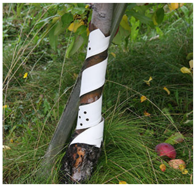
Spiral tree guard, not recommended.

I do not recommend paper wrap-around guards. They must be tied in place with string or wire, which can girdle the tree unless it is removed