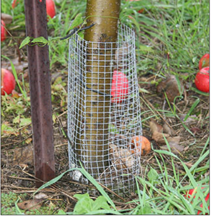
Hardware cloth vole guard.

Pine vole is easiest to trap in May or June, or mid-September or through mid-November.