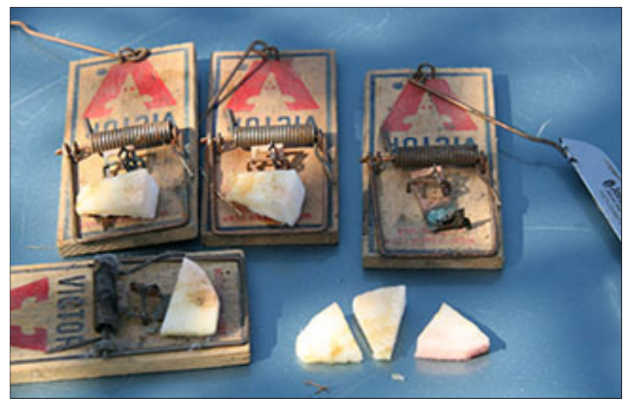
Baited vole traps ready to set.

For meadow vole, search for active runs in the orchard floor vegetation. Place the bait end of a trap extending into the run. Bait the trap with a tiny wedge of fresh apple. I modify the standard metal bait holder by cutting it into a wedge. That is perfect to impale a small, fresh cube of apple. Mark the trap site with a wire flag or bright plastic flagging, or you'll lose track of where it is. Tying them to an anchor stake will prevent small scavengers from removing the trapped animal and the trap, before you can find and identify the catch.