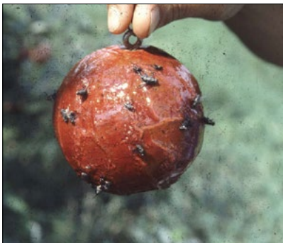
Red sphere sticky trap used to monitor blueberry fruit flies.

Highbush plantings that are kept well-picked usually have few problems with blueberry fruit fly.