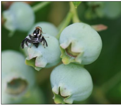
Adults are most abundant July 1 st to 15 th .