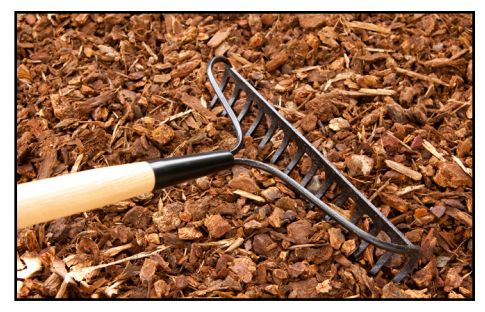
Wood chips can be used as mulch.