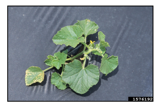
Black plastic used as mulch.

• Black Plastic — Excellent for conserving moisture and nutrients, warming the soil, and providing weed control. It is difficult to apply under windy conditions. Since it will not decompose in the soil, it must be removed after each crop. Removal is easiest right after the crop is finished. In selected locations, and when handled carefully, it can be used more than one year. The most convenient size to use is 1½ mm thick (0.015 inches) and 3 to 4 feet wide. Crops responding best to black plastic are vine crops (cucumbers, melons and squash), tomatoes, peppers, and eggplant. Before planting (seeds or transplants), lay the plastic tightly and evenly over moist, fertilized soil, securely burying the ends and edges. Cut slits or holes through the plastic to plant seeds or transplants.