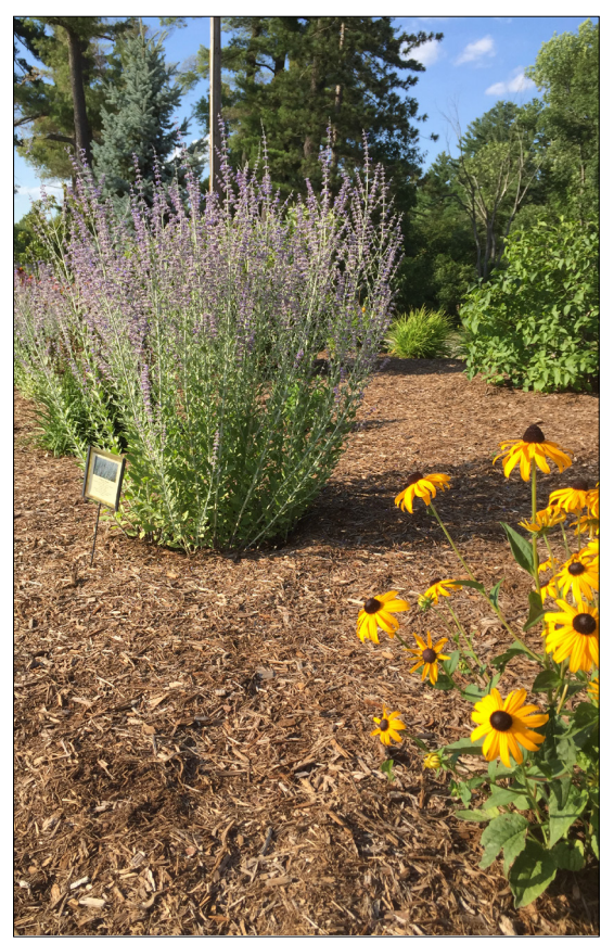
Mulch is applied to increase plant growth.