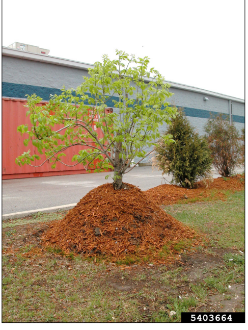
Improper way to apply mulch, referred to as a "Mulch Volcano".